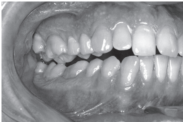
Slika 3. Ravnotežni (balansni) dodir između zuba 16 i 47 na neradnoj strani tijekom lijeve laterotruzijske kretnje vođene očnjakom Figure 3 The balanced contact between tooth 16 and tooth 47 on the non-working side during left laterotrusion movement by canine guidance