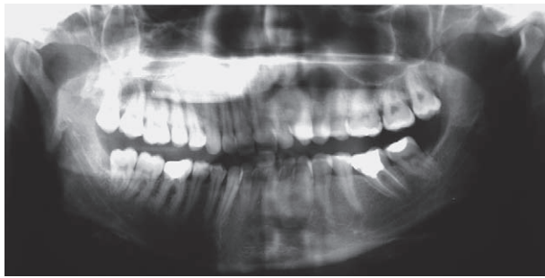
Slika 1. Ortopantomogramski prikaz zubnog statusa pacijentice Figure 1 Panoramic image of patient's dental status

su nicali te ih je prije terapije udlagom izvadila zbog premalo mjesta u zubnom luku i tercijalne kompresije. U objema lateralnim kretnjama bilo je prisutno vođenje očnjakom, ali je tijekom lijeve lateralne kretnje uočen interferentni dodir na zubima 16 i 47 na mediotruzijskoj strani (Slika 3.).