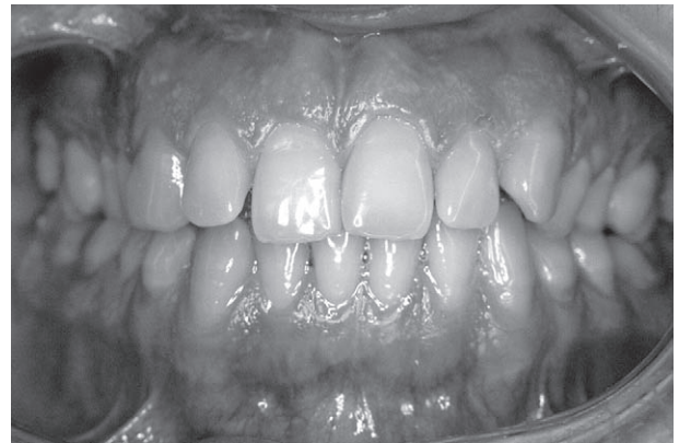
Slika 2. Habitualna okluzija pacijentice Figure 2 The patient's habitual occlusion

ensured. The upper wisdom teeth erupted with difficulty so she had them extracted prior to splint treatment due to lack of space in the dental arch and due to tercial compression. In both lateral movements there was a canine guidance, but during left lateral movement the patient had mediotrusive contact with teeth 16 and 47 (Figure 3).