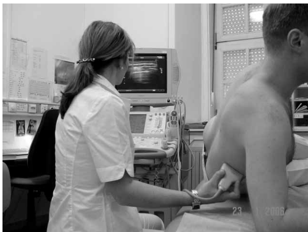
Fig. 6. Figure shows the »elbow position« with the placement of the transducer during examination of the right pleural space.