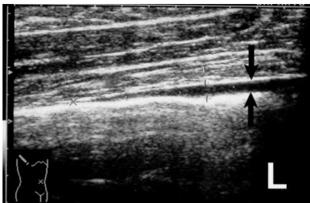
Fig. 7. Typical »wedge-shaped« appearance of physiologic pleural fluid in a person with »wet pleural space« (between arrows), L – liver.

effusions come in site by described manoeuvre as lateral fluid accumulation.