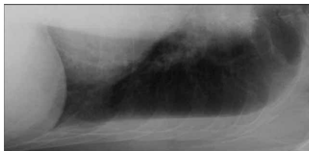
Fig. 2. a) only medial displacement of costophrenic angle on erect chest X-ray (arrows). b) about one cm thick fluid layer (approximately 200 mm of fluid) on the the left lateral decubitus view (with permission from Radiol Oncol 2005; 39(4): 237–42).