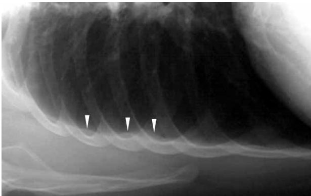
Fig. 4. Right lateral decubitus chest x-ray radiograph – in obese patient subpleural fat layer of at least 3mm can mimic free pleural fluid. Note typical »undulation« appearance of fat (arrowheads).

We are proposing new criteria for small pleural effusion in the lateral decubitus position. This includes fluid density from 3 mm to 15 mm in thickness, with horizontal air-fluid level at lateral dependent chest wall (Figure 3). The skin folds, sheets and subpleural fat can mimic thin fluid layer (Figure 4). Thinner densities are difficult to interpret.