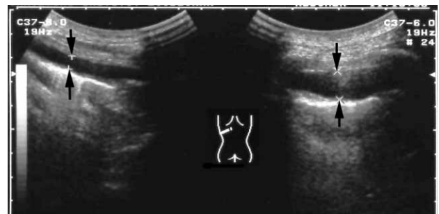
Fig. 5. Sonograms in a patient with right upper lobe lung cancer. Images show a thin (5 mm, arrows) fluid collection during inspiration (left image) that was more conspicuous (10 mm, arrows) during expiration (right image).

In the comparative study Kocijančić et al. 26 tested chest US versus expiratory lateral decubitus radiography and showed both to be efficient methods for demonstrating small pleural effusions. However, US appear to assess the thickness of fluid layer more accurately than radiography does. Last but not least, this study showed the main sign, allowing the demonstration of the smallest effusions, was similar in both modalities: the fluid layer thickness changes during inspiration – expiration (Figure 5). The thickness of the fluid layer was between 3–15 mm with both examination modalities. The most frequent signs on erect chest radiograms were medial displacement of costophrenic angle and small meniscus sign – detected in 40% of the patients.