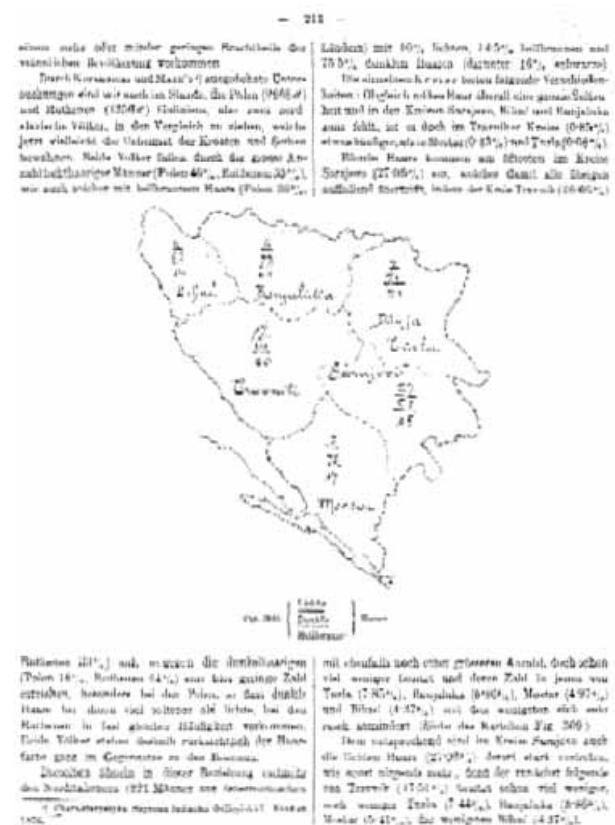
Fig. 1. First population study with samples collected directly in B&H – Weissbach 1895 9 .

The same author compared these results with other regional Slavic populations a few years later, searching