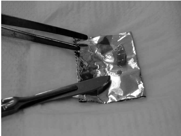
Fig. 6. Preparation of tumor specimens for DNA/RNA extraction.

plex genetic traits and methodology of their dissection was simultaneously accumulated. The main approach in population based genetic association studies is generally based on relative differences in allele, genotype or haplotype frequencies distribution between two population subgroups – case (experimental) and control group. Positive association of certain value with the analyzed trait or condition (normal or abnormal character) may be an indication of positive gene identification, but in most cases this finding needs to be replicated in order ascertain true association. Application of the latest molecular genetic techniques in Bosnia and Herzegovina positively influenced development of scientific research in this field.