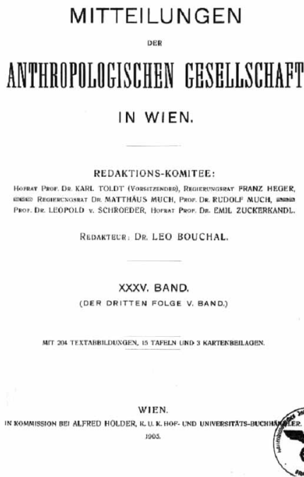
Fig. 2. First comparison of B&H and other regional data – Weissbach 1895 10 .

for similarities as well as differences among them (Figure 2, 10 ). Weissbach developed interesting »questionnaire approach« to the study and some of his questions may be considered quite unusual today, such as: What is an average marriage age of women?; What kind of family hierarchy exists between a wife and a husband?; What an average duration of nursing?; What is the preferred position in nursing? etc.