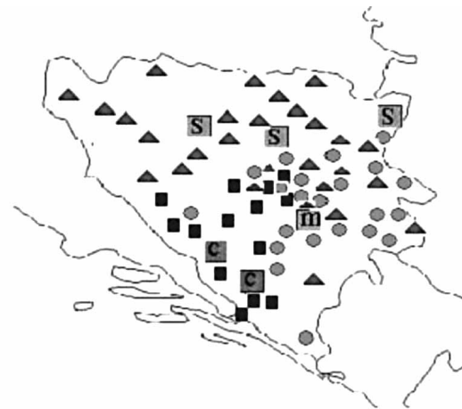
Fig. 5. Y-chromosome (biallelic markers) study of representative B&H human population sample (256 male individuals from more than 50 towns) – Marjanović 2005 63 .

Finally, the most recent results were obtained by observing Y-chromosome biallelic markers in B&H population. Certain preliminary data population was concurrent with earlier regional studies 61–62 . This study was constructed on the ground of regional data and designed to include 256 male individuals (Figure 5) 63,64 . The results of it showed that the three populations (three main Bosnian and Herzegovinian ethnic groups) were genetically extremely close to each other, and closely related to