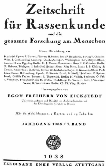
Fig. 3. First studies of races and racial biodiversity in Yugoslavia (including Bosnia and Herzegovina – Škerlj 1938 13 ).

As the results obtained through the analysis of phenotypic markers serve as a good model for additional test-