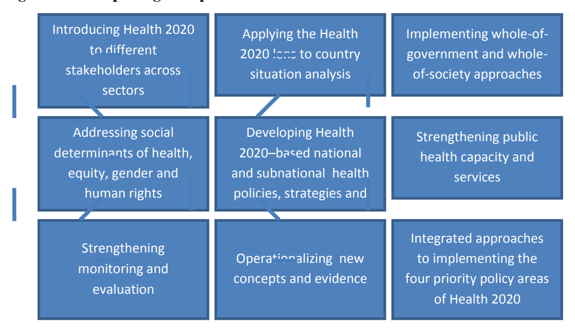
Fig. 2. The nine package components of Health 2020

Health impact assessment and economic evaluation are also valuable tools in assessing the potential impact of policies and can also be used to assess how policies affect equity, and both qualitative and quantitative health data can be used to assess how policies affect health.