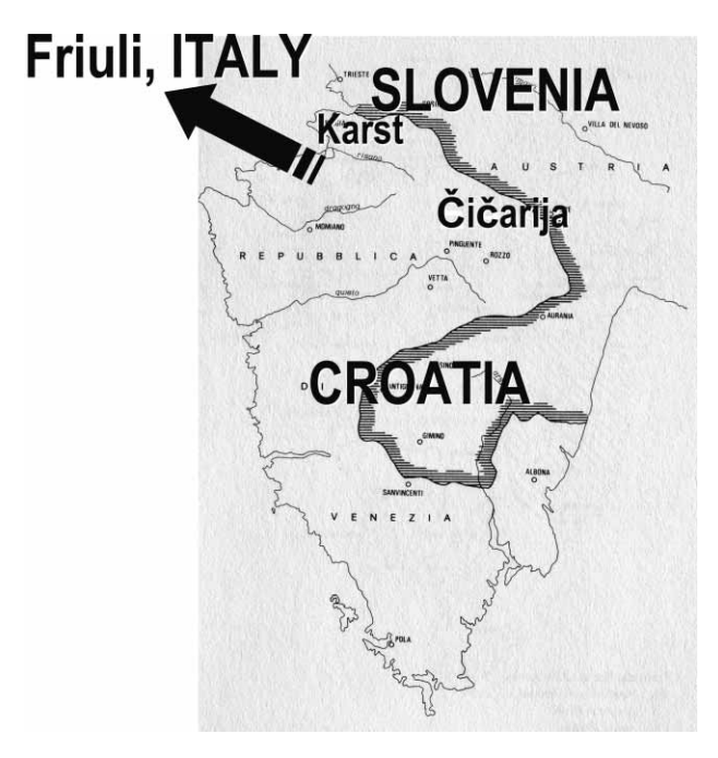
Fig. 1. Location of Istria (historical map showing the former border between the Republic of Venice and the Austrian empire).

Italian (which is spoken by even the oldest community members), notes were taken, and audio or video recordings were made of the interviewees when possible. All plants quoted during the interviews were gathered and identified following the standard works of the Italian and Istrian flora<sup>4,5</sup>. Voucher specimens were deposited in the Pharmacognosy Herbarium of the University of Bradford (international code: PSGB). Comparative analysis with our previously conducted study on the phytotherapy of the Istro-Romanians, as well as with other ethno-