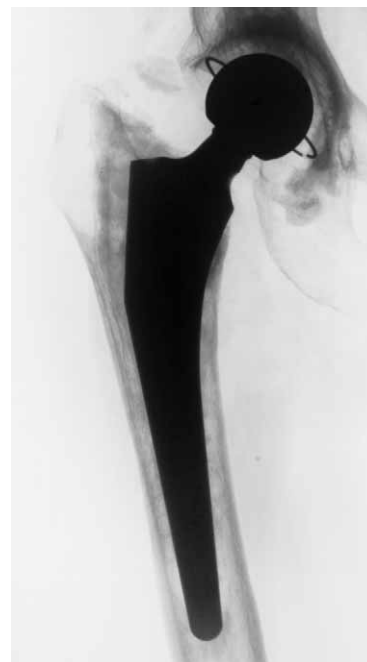
Fig. 1. X-ray of the Müller type cemented hip prosthesis with a stem occupying <90% of femoral canal diameter: A – directly after implantation; B – loosened 5 years later.

with the inner part of the femoral canal in the AP projection. In both groups this was in the lower part of the stem, which corresponds to the upper half of the Gruen zones 3 and 5. In the first group the most intimate contact was achieved with the lateral side of the femoral canal, while in the second group the distance between lateral and medial walls was equal.