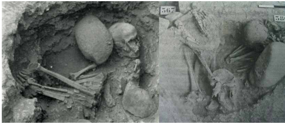
Fig. 5. Khirokitia, Cyprus, Eneolithic burial (III millennium BC)

Such funeral practices are associated with burials involving extraordinary arrangements of the bodies, as documented in the Balkan and Aegean areas and at Cyprus in particular, from the Neolithic to the Early Middle Ages 5 (Figure 5). This practice is conditioned by necrophobia (Necros + Phobos), i.e. fear that the deceased will return to terrorize the living.