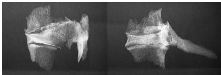
Fig. 7. Burial II in grave no. 1. Digital radiography of the three assembled fragments (T11-L1). Note the wedge-shaped deformation of the body of T12 and the absence of osteolysis of the spongy bone.

The data reported here are an attempt to define the physical characteristics, living conditions and the state of health of a small sample from early Iron Age graves (IX–VIII century BC). Unfortunately, the poor state of preservation of the skeletal remains from grave no. 1