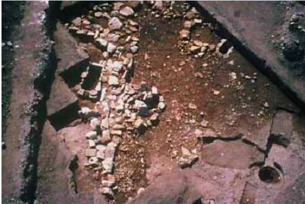
Fig. 1. Building with paved internal courtyard. Grave no. 2 can be seen in the upper right, grave no. 1 in the upper left.

Grave no. 1 (Figure 2), inside the building, was oriented in an east/west direction and contained three individuals with their heads facing eastward. The three bodies were supine and partially overlapping, suggesting that they were buried at the same time.