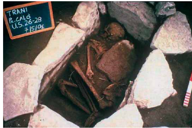
Fig. 3. Grave no. 2 with the single burial in situ. The body is sealed in the grave by a large stone slab placed on the back.

All the individuals present peri-mortem loss of an upper medial incisor, the right in grave no. 1 and the left in