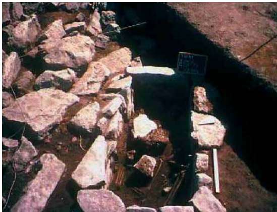
Fig. 2. Grave no. 1 with the three burials in situ.

All three individuals were buried with a boulder placed on the coffin. The boulder in burial I covered the individual's abdominal area. In burial II this covered the thorax, abdomen and forearms, while the smaller boulder in burial III covered the left hemithorax and shoulder.