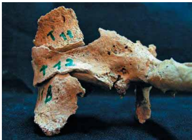
Fig. 6. Thoraco-lumbar segment (T11-L1) of the vertebral column of burial II in grave no. 1 in left antero-lateral view.

On the skeletal remains of burial II in grave no. 1, we observed alterations of the thoraco-lumbar segment (T11 to L1) of the vertebral column that suggested a serious inflammatory infectious process (Pott's disease). In T11, the cortex of the anterior body wall is well preserved and the impressions of the annulus fibrosus of the intervertebral disc are recognizable on the inferior surface of the body. T12 presents an anteriorly wedge-shaped body, the superior and inferior surfaces of the body with the impressions of the annulus fibrosus , the left twelfth rib, the costo-transverse joint, the left pedicle, the left superior and inferior articular processes and part of the lamina. In the first lumbar vertebra (L1), the cortex of the anterior body wall is well preserved and the impressions of the annulus fibrosus are recognizable on the inferior surface of the body. The residual spongy bone appears regular (Figure 6).