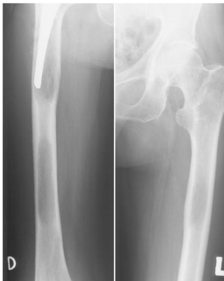
Fig. 1. Initial radiological imaging and bone scintigraphy revealed pathologic fracture of neck of right femoral bone and diaphyseal infiltrations in both femoral bones and right humerus.

tient presented with sore throat and pain in right side of the neck. Physical examination and radiological imaging revealed exophytic tumor of the epiglottis. Laryngomicroscopy and biopsy have been performed and revealed tuberculosis infiltration of the epiglottis and constrictor pharyngis muscle, and one month later pulmonary tuberculosis developed, which has been successfully eradicated till February 2006, by rifampicin (Rimactan), etambutol (Etambutol), pirazynamide (Pyrazinamid) and isoniazide (Eutizon) course. Currently, the patient is well, participating normally in daily activities, and with only detectable infiltration in the right femoral bone.