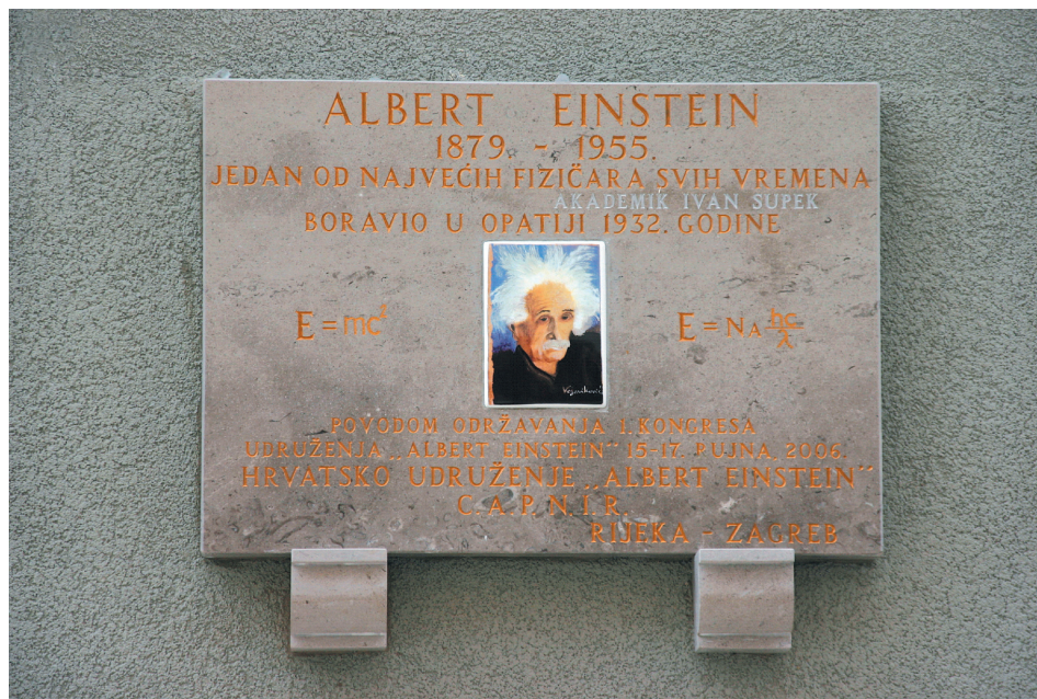
Memorial-tablet to ALBERT EINSTEIN.

In the years 2005-2006 the association CAPNIR organized two expert meetings and the 1 st Croatian Congress, about the influence of non-ionizing radiation on eyes and skin, with the conclusion: according to cumulative biological effect of non-ionizing radiation of sunlight, it is necessary to protect the children in the earlier time, carrying on the »Opatija Declaration – 2006« as the completion of the United Nations Environment Program and UNICEF World declaration about the children protection from the environmental effects of ozone depletion. Opatija Declaration and its activities are the part of program Vision 2020 – THE RIGHT TO SIGHT.