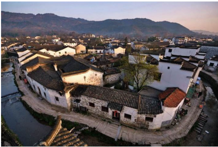
a_1 : Chaji Village, Taohuatan Township, Jing County