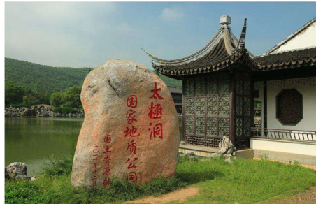
a_2 : Taoyuan Village, Taiji Cave Scenic Area, Guangde County