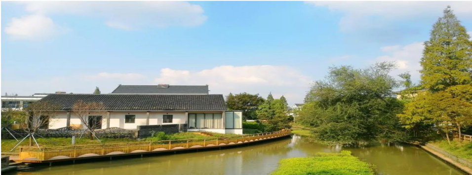
a_3 : Qianqiu Village, Yuntai Township, Ningguo City