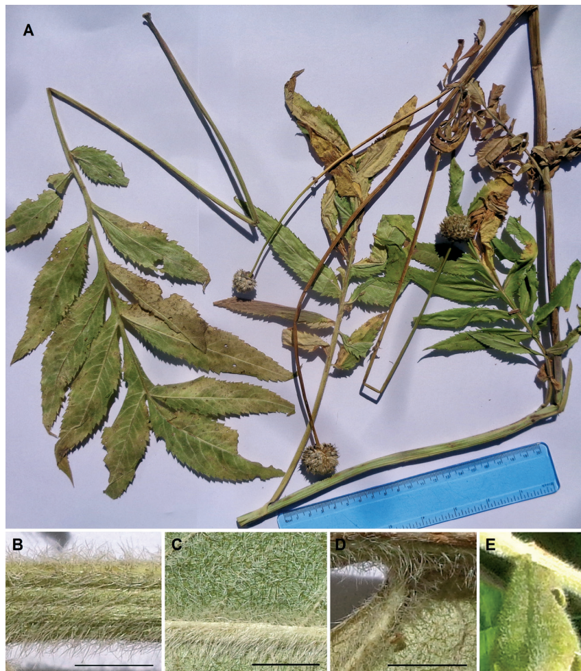
Fig. 1. Cephalaria pastricensis subsp. pologensis : A – holotype (MKNH), B–D – details from the holotype. B – rachis of the basal cauline leaf, C – abaxial surface of the basal cauline leaf, D – abaxial surface of a middle cauline leaf, E – detail from the adaxial surface of a basal cauline leaf of a plant from the type locality. Scale bars = 3 mm.

Other examined collections: North Macedonia, Šar Mountains, 4.5 km NW of Brezno village, roadside in the zone of beech forest, siliceous substrate, 1460 m, 42.111214 N, 20.993406 E, 20.7.2012, leg. & det. A. Teofilovski (herb. A. Teofilovski) (Teofilovski 2014, sub C. pastricensis ); North Macedonia, Šar Mountains, 1.8 km NW of Brezno village, pastures and shrubby places, siliceous substrate, 1570–1590 m a.s.l., 42.092039 N 21.017495 E, 5.8.2013, leg. & det. A.