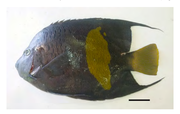
Fig. 2. Pomacanthus maculosus (catalogue number 33-2022) captured from the Syrian coast, scale bar = 40 mm.

preopercle and operculum without spines; bone under eye without large, rear-pointing spines, front soft rays of dorsal and anal fin both with filaments; first 5-7 dorsal fin spines deeply notched; 4th and 5th dorsal rays and 4th and 5th anal rays very elongated; tail fin rounded, body with large and small scales, irregularly arranged, very rough, with distinct ridges on the exposed part, scales extend out onto the median fins; without "axillary process" (an enlarged scale) at the base of the pelvic fins; lateral line complete. Colour of the body is violet blue, exhibiting a narrow, vertical yellow oval bar along the middle of the body; scales on forehead and nape dark blue; tail fin yellowish-white with blue marks (Fig.