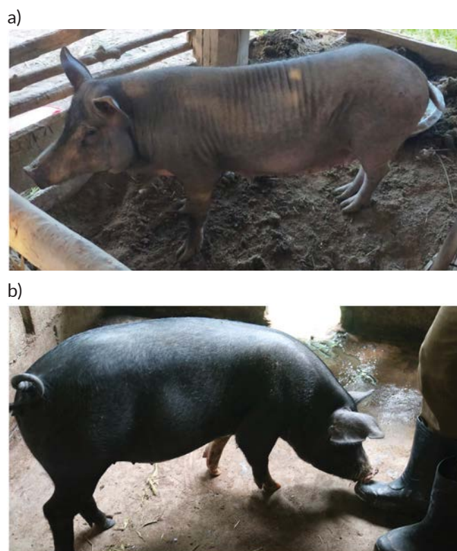
Figure 4. The general appearance of PML gilt (a) and CMD gilt (b)

Nevertheless, the heart girth and body length of CMD gilts were not significantly ( P>0.05 ) different from the mature PML gilts reared by local farmers. But, the average body length and heart girth of CMD gilts at first mating are longer, almost 10 cm more than the mature PML gilts. However, the present results slightly differ from Nong Taeng black pig (CMD x CMD), with an average wither length at first mating of about 61.33 cm and a body length of about 83.17 cm (Keonouchanh, 2018). But the body weight at first mating of CMD was significantly smaller, almost twice times compared to Nong Taeng black pig (39.86 vs. 80.33 kg). The correct reason for this difference still needs more scientific studies to approve. But, the difference between the age at first mating might be one of the pre-assumption when our team allowed the gilts to be mated at 193 days while Nong Taeng black pig was 226 days (Keonouchanh, 2018). Nevertheless, we observed a longer body length and heart girth of the CMD than PML gilts (Figure 4) and MPL sows raised by local farmers, with an average of about 92.5 and 93 cm, respectively (Keonouchanh et al., 2011).