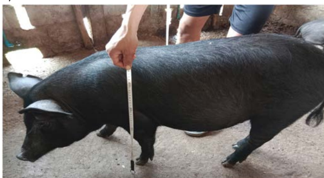
Figure 1. Heart girth (a), and height at wither (b) measurement