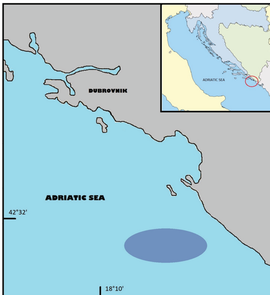
Figure 1 Sampling location in the southern Adriatic Sea (Croatia)

The 360 individuals of stargazer analysed in this study were collected monthly from October 2011 to September 2012 in the southern Adriatic Sea (Figure 1). This area is characterized by a seabed covered with muddy sediment [2]. The specimens were collected during day time hours at depths of 100 to 140 m using a commercial bottom trawl net. The net was 45 m long with 24 mm stretched mesh cod-end. The duration of each haul was about 3 h and the trawling speed fluctuated from 2.6 to 2.9 knots. After the catch the samples were stored on ice and transferred to the laboratory. There was no evidence of regurgitation. Total length (TL) of specimens was measured to the nearest 0.1 cm and weight (W) to the nearest 0.1 g per individual. Sex of fish was determined by eye examination of gonadal tissue. Stomachs were dissected and weighed to the nearest 0.001 g. The stomach contents and each individual prey