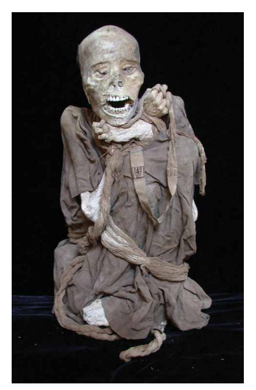
Fig. 7. Artificial Chachapoya mummy. Male.

The site was found by looters but prompt archaeological work recovered unique evidence of these peoples. This humid area was the one with the least expectations for the preservation of organic material. In fact, the archaeology of the Chachapoya culture has had to rely on its impressive monumental architecture and pottery for cultural reconstruction. In this case, the careful selection of the location for funerary remains along with the cultural practices to prepare the bodies were responsible for this exceptional preservation.