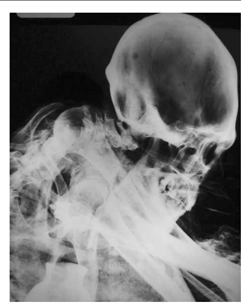
Fig. 6. X-ray showing Chiribaya pot inside the chest cavity of Chiribaya man.

The bodies were disposed of in typical rectangular cut tombs, with the long side walls lined with stone. The body was placed at one end and surrounded with offerings for the afterlife. The grave goods included food and beverage presented in the characteristic tricolor Chiribaya pot-