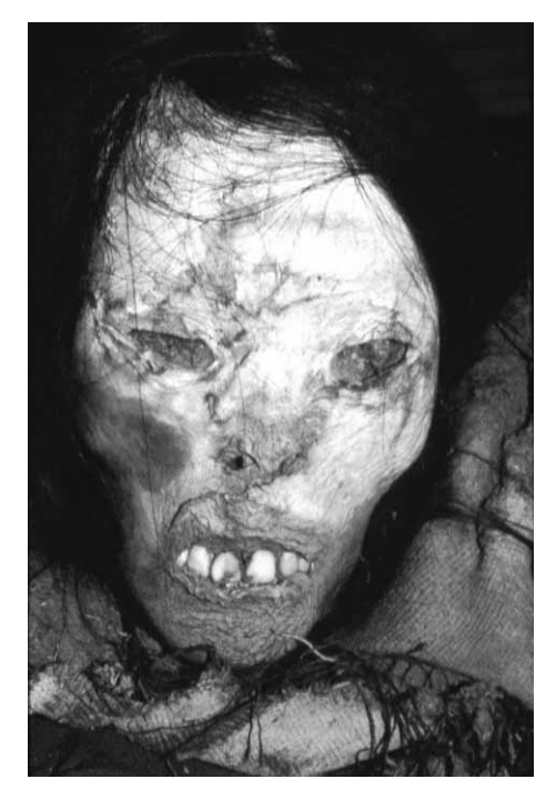
Fig. 2. Face of Ice Maiden from Mount Ampato.

Cerro El Plomo (Chile)<sup>22</sup>, Cerro Esmeralda (Chile)<sup>23</sup>, Pichu Pichu (Peru)<sup>20,24,25</sup>, and Ampato (Peru) and Llullaillaco (Argentina)<sup>26-28</sup> involve the deposition of young individuals as offerings at Inca mountain sanctuaries, associated with other offerings. These sacrifices had been elaborately dressed and deposited in specially-prepared mountain peak shrines, with metal and shell statues. The child recovered from El Plomo died of hypothermia, the body became freeze-dried and the deeper soft tissue layers transformed into adipocere<sup>24</sup>. In most other cases, the bodies became frozen without any indication that this was the effect expected. Furthermore, the high number of bodies destroyed by lightning could suggest that the chosen location for deposition of the bodies, and the use of metal artifacts on or around them were set to