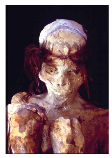
Fig. 5. Detail showing calcined exposed cranial bones of artificially prepared Chiribaya mummy. Female.