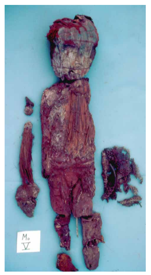
Fig. 3. Artificial Chinchorro Mummy from site Morro 1-5, Arica, Chile.

cial social mechanisms might have become necessary to protect access to resources.