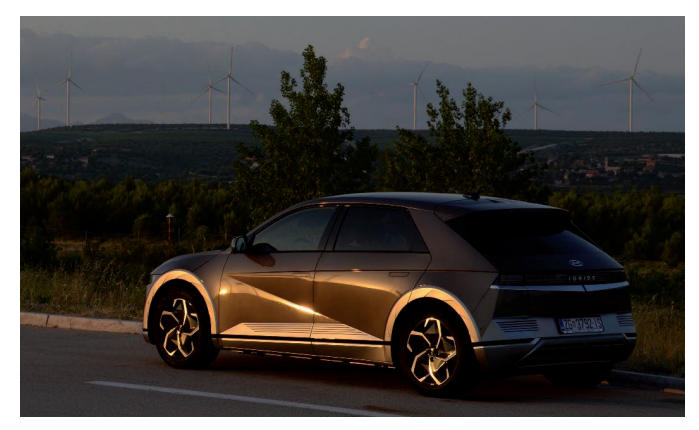
Fig. 4. EV at the wind power plant site

The primary goal of this trip was to reach the destination – a wind power plant (WPP) named VE Voštane in the south of Croatia, located 430 km from Zagreb, mostly on highway. The V2Load function of the vehicle was used to run the electrical equipment and a laptop while conducting field work in the wind power plant (Fig. 2).