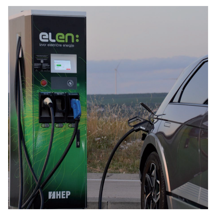
Fig. 9. Hyundai IONIQ 5 charging at Janjče ELEN charging station

Generally, all the visited charging stations were operational, providing charge speeds as specified. DC chargers of speeds 50 kW (Fig. 14) and more were available at each charging points as specified. There were no waiting queues, no technical, software, nor any payment issues. Table V gives an overview of the charging data for this trip.