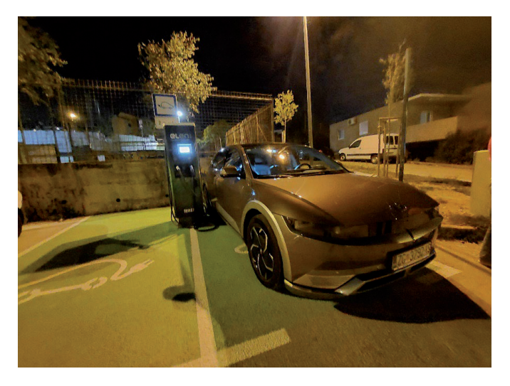
Fig. 11. Hyundai IONIQ 5 charging at Dračevac ELEN charging station

The last stop before the destination was Rašćane Gornje gas station back on the highway where another ELEN 50 kW CCS2 charger was located. The charger was hard to find on the large parking lot at night as it wasn't marked or illuminated in any way. The final charge of the trip took 77 mins in total (26 - 81% in 53 mins, 81 - 89% in 9 mins and 89 - 100% in 15 mins). Upon arriving to the destination in Cavtat, the battery charge was 65\% with an estimated range of 203 km. The time of arrival was around 22:30 h. In other words, a trip of 650 km (with detours and charging) took almost 14 hours to complete. On a scale of 0 to 10, we would rate the experience as 1 just for the sake of making it to the destination.