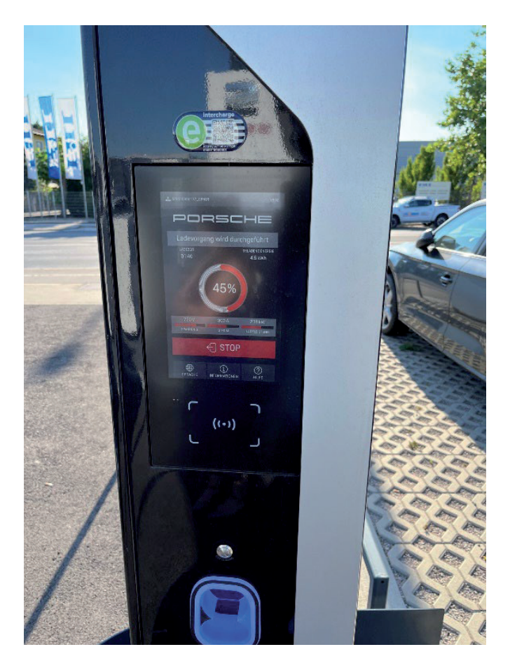
Fig. 1 Porsche Zentrum Wien-Liesing charging station

After charging to 89%, we went to the shopping mall Westfield Shopping City Sud, only few km away from the Porsche Zentrum Wien-Liesing. The idea was to take advantage of this and slowcharge the vehicle to 100%. Even though Westfield Shopping City Sud is a huge shopping mall, we were only able to find Type 2 charging point with an additional regular shuko plug. Since we did not have a charging cable, we used shuko plug at 3.3 kW. The reserved amount was 20 Eur, however, no cost was claimed in the end. The charging experience at the Westfield Shopping City Sud was by far the worst throughout the trip.