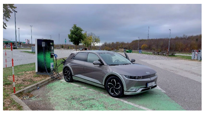
Fig. 10. Hyundai IONIQ 5 charging at Janjče ELEN charging station

The trip started on Sunday, November 6 2022 around 8:50 in the morning with 94% of battery charge. This was the longest trip we took (around 650 km one-way) which turned out to be the most eventful and challenging as well. We tested the battery capacities on higher speeds in the first part of the trip so the first mandatory stop was Janjče Crodux gas station (Figure 10); 170 km from the starting point. The vehicle was charged using 50 kW CCS2 charger operated by ELEN from 16% to 44% battery capacity in 25 minutes (110 km of range). The whole experience was unpleasant as the designated app through which payment is done froze and crashed multiple times and emergency eject button had to be used to unplug the vehicle. Additional funds were reserved (HRK 400, which were subsequently refunded) for restarting the app and repeating the procedure of charging in an attempt to unplug the vehicle normally.