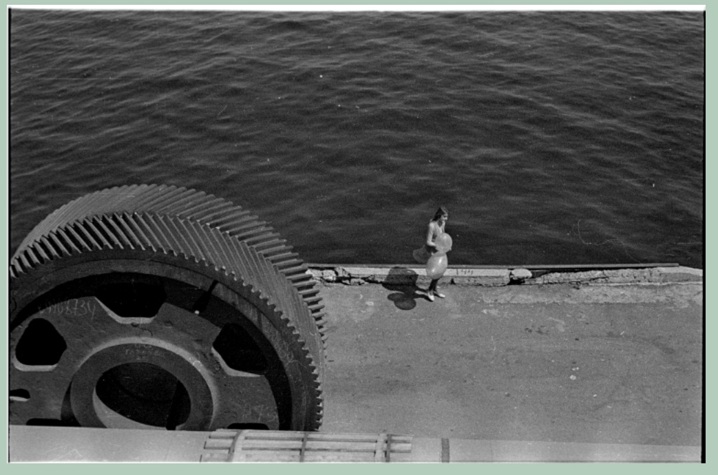
Sl. / Fig. 4 1970-e / 1970s.

Frequently, in contemporary cultural studies, the term "vernacular" is used to define this type of photography. In this research, I would like to avoid using this term because different theorists give different meanings to it and as a rule, it refers to the photography belonging to amateurs. Maria-Alina Asavei particularizes the complexity and ambiguity of this term. Cf. Asavei, "Indexical Realism during Socialism: Documenting and Remembering the 'Everyday Realities' of Late insofar as some of the photographs were taken covertly, Socialist Romania through Photographs", 8.