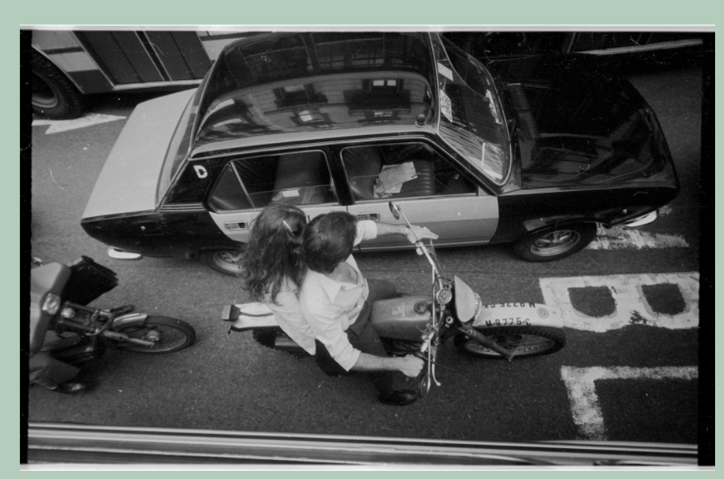
SI. / Fig. 5 1980-e / 1980s.