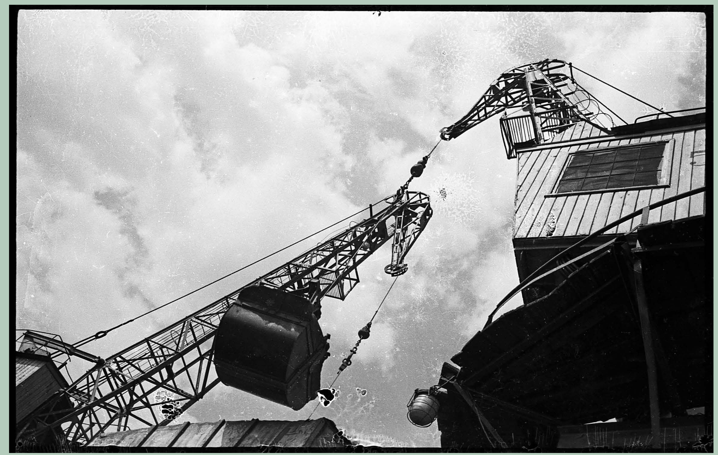
SI. / Fig. 2 Sa snimanja filma Život dizalica / Behind the scenes of Life of Cranes , 1964. ↑