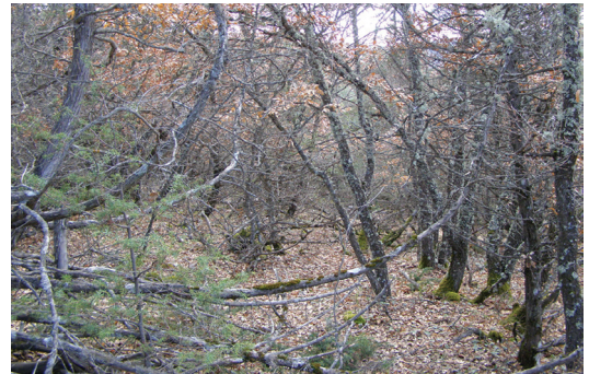
Figure 2. MSWG (Mixed Stands Without Gaps). On the left side of the photograph a part of trunk of a Greek juniper tree can be seen, while in the background on the right side of the photograph a Greek juniper tree can be faintly seen. The rest of the trees in the photograph are other tree species that grow in mixed stands.