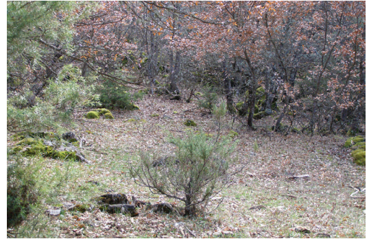
Figure 1. MSSG (Mixed Stands with Small Gaps). In the foreground of the photograph, a Greek juniper regeneration plant can be seen. The rest of the trees in the photograph are other tree species.

MSWG: Quercus pubescens , Acer monspessulanum , Quercus macedonica , Carpinus orientalis , Juniperus oxycedrus , Quercus cerris L. and Cornus mas .