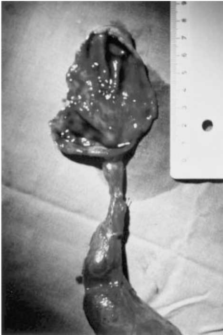
Fig. 2. Resected specimen of the choledochal cyst and gallbladder.

mor in cyst. Intraoperative histological examination of lymph nodes didn't found malignant infiltration. For this reasons we decided to make only an en-bloc resection of the choledochal cyst and gallbladder with hepaticojejunostomy Roux-en-Y. The gallbladder and excised choledochal cyst were sent for pathological examination (Figure 2). The patient was discharged from our hospital two weeks postoperatively without complications. On histological examination the gallbladder was 6×5 cm in size and gallbladder wall was 0.4 cm thick and without gallstones. The choledochal cyst was 8×5×4 cm in size and with few small gallstones. On the central part of choledochal cysts mucosa it was shown a white plain area of thickness 0.3 cm and 0.8 cm in diameter. The lesion was firm. Histological examination