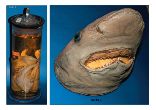
Fig. 3. Left: Four embryos of porbeagle housed by Katurić in 1910 in the Nature History department of the National Museum in Zadar. Right: Head of a 260 cm long female porbeagle captured at Kukljica on Ugljan Island (Middle Adriatic) in March 1910.

The catch of a juvenile porbeagle represents further evidence of the presence of this lamnoid shark in the Adriatic Sea. Despite some new records were reported in recent years, the porbeagle should still be considered as a very rare shark in the Adriatic Sea. This large sized and slow growing species with low reproductive capacity is nowadays highly vulnerable to population depletion due to commercial and incidental fisheries and its Mediterranean population is evaluated as a critically endangered (STEVENS et al. , 2006).