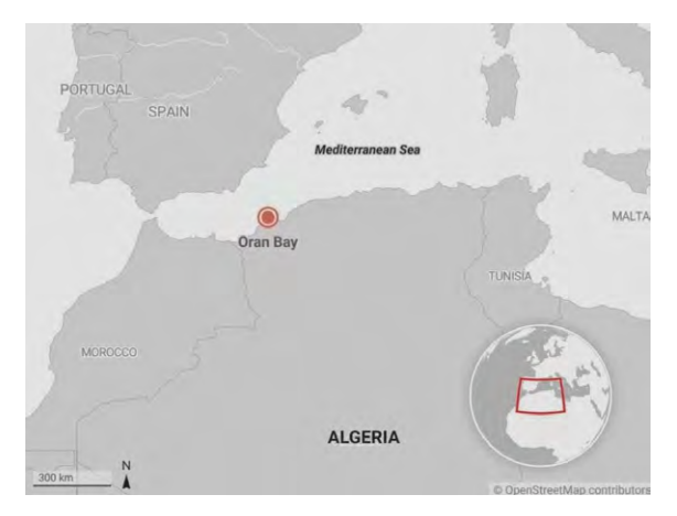
Fig. 1. Map showing sampling location: Oran Bay (Algerian west coast).

The fish were carefully stored in clean labeled polythene bags and transported in ice bags to the laboratory for subsequent analysis of the metal content in their tissues. Each individual underwent a series of measurements, allowing them to be categorized into size and sex classes. The sex of each fish was determined visually, and the total length was measured from the tip of the upper jawbone, adjusted to the lower 1 cm. A total of 160 M. merluccius individuals were collected (80 males and 80 females), with all individuals falling within the