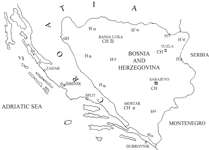
Fig. 2. Map of health institutions location before the war on the territory of Bosnia and Herzegovina: CH – University Hospital, H – Hospital.

the pre-war distribution of health institutions in Bosnia and Herzegovina. It is important to note their location in relation to the ethnic map so as to have a better understanding of the problems which the health services faced with the first and, later, the second reorganization. Figure 3 shows the ethnic map of Bosnia and Herzegovina immediately prior to the signing of the Dayton Agreement. This shows that a greater part of the territory was occupied by Serbs while the majority of those who were expelled from these territories or killed were of Croat or Muslim origin. A comparison of Figures 2 and 3 shows that the greatest number of pre-war health institutions was occupied by Serbs while a substantial number was demolished. This also indicates that Croats and Muslims had just a small number of health institutions and an urgent need for a new plan of activities in wartime conditions was imperative.