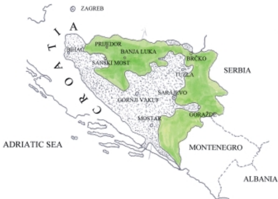
Fig. 3. Map of ethnic composition of Bosnia and Herzegovina immediately prior to Dayton agreement: grey – Bosnian Serbs territory, dotted – Bosnian Croats and Muslims territory.

centuries-old domiciles, now occupied by Serbs, towards the territory under the control of the Croatian Defense Council. Hundreds of thousands of Croats and Muslims were then either killed or expelled from their homes, and some of them were sent to concentration camps, where, again, many perished. This ethnic shift of the population to places they had never inhabited before initially caused great confusion and enormous difficulties in every respect, medical care included. Medical personnel had to provide for the local population as well as thousands of newcomers. Figure 4 shows clearly that the wartime health services of the Croatian Defense Council had a small number of medical institutions as well as qualified staff, but they had to confront the sudden increase in requirements arising from the war. Because of a great shortage of medical institutions, church, school and factory cellar premises were, in many places,