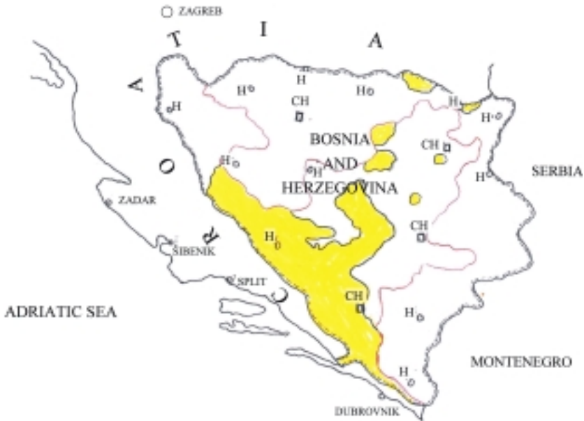
Fig. 4. Grey – territory of Bosnia and Herzegovina under control of the Croatian Defense Council with marked health institutions. CH – University Hospital, H – Hospital.

bodies, municipalities were bases for the organization of defense, so that municipality health headquarters were immediately formed then with their chief-of-staff as commanding officer. In most cases, health centers were reorganized into larger medical corps units and their pre-war heads appointed chief of staff in wartime conditions. These institutions also had authority over the first medical echelon and, therefore, the right to appoint military unit physicians. Some health centers were transformed into war hospitals where even the most complex surgical operations were performed. They had their own pharmacies, and epidemiological and other indispensable services for the smooth running of war health services in the area. Thus, they constituted wartime health units which were of extreme importance, especially regarding the situation in the war, since some areas had, for a long time, been totally isolated and surrounded by the enemy. Moreover,