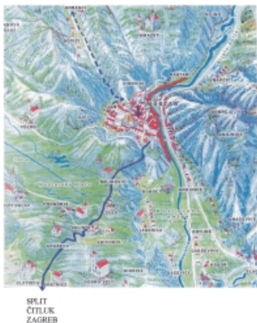
Fig. 5. Draft of the position of Mostar: the Mostar War Hospital (✚), reserve and rear war hospitals (✚+), evacuation route (blue line), and battlefield line (red line).

sea level. Figure 5 shows evacuation and local supply routes as well. The location of the wartime hospital is also marked so that its distance (circa 150 m) from the battlefield line is clearly visible. Evacuation routes were constantly shelled and under sniper target from the surrounding hills – a distance of 1,000 – 2,000 m as the crow flies. The only evacuation and supply route for Mostar was in the northwest, across the area under military control of the Croatian Defense Council. That road was called »The Salvation Trail« (Figure 5), and it was under constant enemy fire so that communication along it was possible only at night.