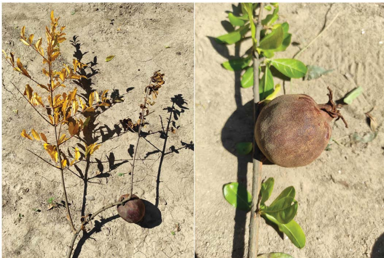
Figure 1. Natural infection observed on twig and fruit of pomegranate cv. Wonderful

A fungus identified as Coniella granati was isolated from 23 out of 24 symptomatic plant samples (fruits, twigs and trunk base wood). The presence of Phytophthora species was not confirmed in the soil samples or crown tissues. All isolates obtained in this study developed white to yellowish compact mycelium on PDA (Figure 2). Irregular concentric rings of pycnidia developed within 15 days of incubation. On CPA, the mycelium was less compact and whitish, with pycnidia regularly within one week of incubation. The effects of different culture media on the