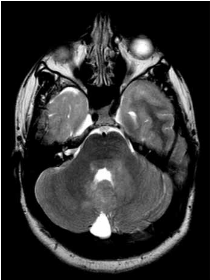
Figure 1. T2-weighted brain MRI: Axial view showing characteristic NF changes of cerebellum and brainstem.