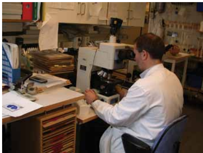
Figure 2. With NIKON microscope, I did have the most advanced one, 2001

One of the main goals of our student organization was to produce teaching material in form of transcripts of lectures for those subjects where our professors were not able or not willing to write a textbook, or translate a text from a foreign language. The typical example was pathophysiology where we did not have any official literature but rather machine written short texts that was provided after we have heard each lecture. We were working day and night to get enough copies for the entire class using two Gestetners mimeographs which used to be always out of function after a few hours of printing. The copy machines were the accessible in the main administration offices but could not be used by us students. The second important activity was improvement of teaching and education via a student teaching committee led by us and Dr. Branko Richter, the Professor of parasitology. His contribution to our studies during the first 3-4 years was immeasurable.