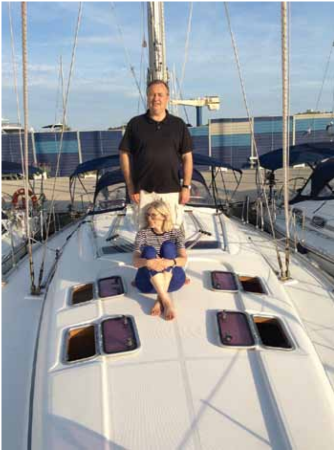
Figure 15. With my wife at the summer holidays 2015