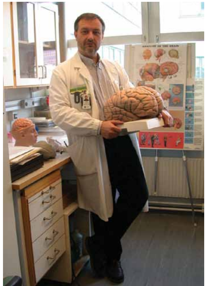
Figure 10. Clinician in the lab 2006