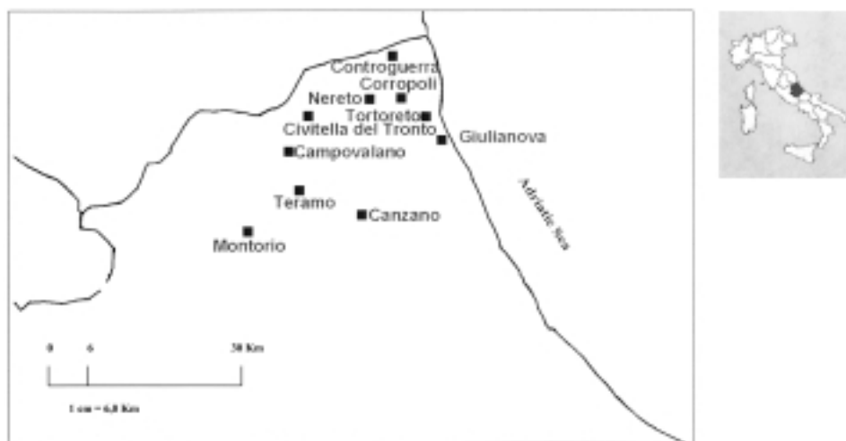
Fig. 1. The Abruzzo Region and the geographical position of the investigated town and villages in the Province of Teramo.

ment of small textile, clothing and leather firms, which radically modified and expanded the labour market. In more recent years, however, there has been a crisis in terms of employment opportunities and production costs, because of the opening of economically more competitive markets in Eastern Europe. This problem was solved with the revision and improvement of technologies and product quality, which aligned and included the zone within the neighboring area of Ascoli Piceno to the north, where the advanced 'Adriatic economic model' developed 33 .