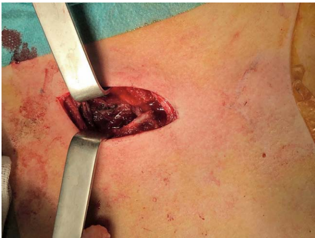
FIGURE 3. An incision from the medial part of the right clavicle to the medial part of the sternum enables a direct approach to the sternoclavicular joint.