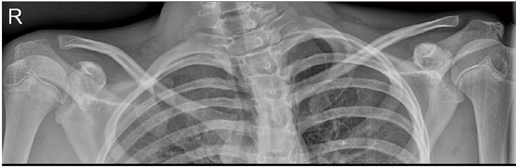
FIGURE 1. Radiographic examination reveals a sternoclavicular dislocation whereby it is difficult to determine the direction of dislocation.