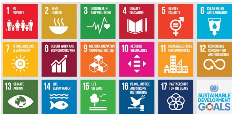
Figure 1: Sustainable Development Goals 2030

Based on the aforementioned goals, it can be deduced that different goals will be pursued in various nations and organisations according to the activity, the business, and the business model. We emphasise the need for monitoring and measuring while defining goals.