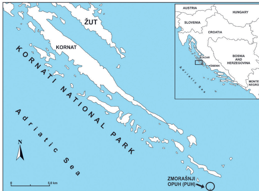
Fig. 1. Map of the study area with location (circled) of the islet of Zmorašnji Opuh (Puh) in the southeastern part of the Kornati National Park. The square on the map in the upper right corner shows the study area in the SE European context.

of the Middle Adriatic (Fig. 1). The bedrock consists of carbonate rocks, mainly Cretaceous limestones and dolomites (Pandža 2010). Brown soil (calcareous cambisol) of shallow to medium depth is the most widespread type. The climate is Mediterranean, with an average annual air temperature of 16.3 °C and an average annual precipitation of 571.8 mm. North winds prevail. The KNP is classified among Croatia's Important Plant Areas (IPAs) and is part of the Natura 2000 ecological network (Official Gazette 2019). Halophilic and halotolerant vegetation overlap largely due to the constant influence of the sea (waves, salt spray and strong winds) over a small altitudinal gradient on most of the islets. The increase in tourism, the abandonment of traditional agriculture, physical changes in ecosystems, the invasion of exotic species and global climate change are the factors that contribute most to environmental risks (Pandža 2010).