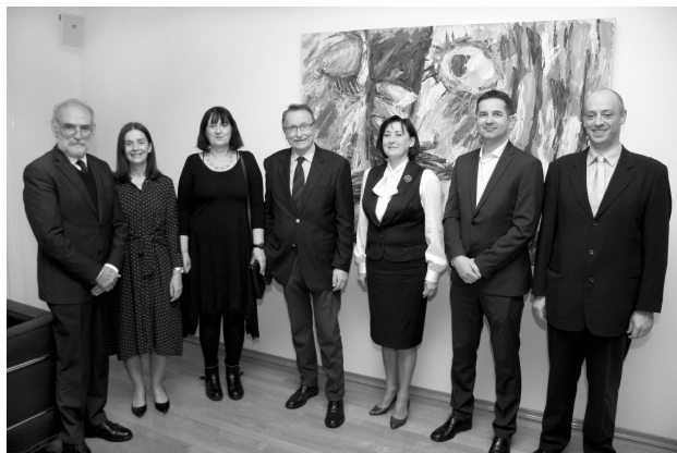
Fig. 4. Organizers of the round table with the president of the Croatian Academy of Sciences and Arts.

Institute of Croatian Language and Linguistics Croatian Academy of Sciences and Arts Scientific Council for Anthropological Research of the Croatian Academy of Sciences and Arts Terminology Commission under the International Committee of Slavonic Scholars