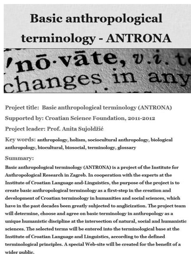
Fig. 1. Website of the ANTRONA project.

Challenges and New Approaches to Scientific Research” was organized by the Institute of Croatian Language and Linguistics, Croatian Academy of Sciences and Arts, Scientific Council for Anthropological Research of the Croatian Academy of Sciences and Arts, and the Terminological Commission under the International Committee of Slavonic Scholars. The members of the Terminological Commission of the International Committee of Slavonic Scholars attended the round table (Figures 3 and 4).