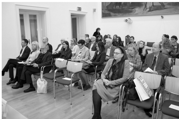
Fig. 3. Participants of the first terminological round table.