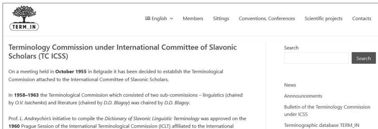
Fig. 6. Website of the Terminology Commission.