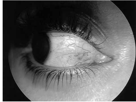
Fig. 1. Conjunctival vascular congestion over a thickened medial rectus muscle

Anamnestic epidemiological data directed to Trichinellosis and some similar cases in neighboring was categoric negative. In spite of normal eosinophils, negative epidemiological history, and non-respond to corticosteroid therapy, serologic examination for Trichinellosis was indicated. In meantime, high fever persisted, weakness of muscles was progressing to lumbal region and patient was unable to walk. Electromyoneurographic (EMNG)