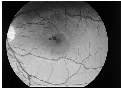
Fig. 2. Fundus photography showing vasculitis and retinal haemorrhages