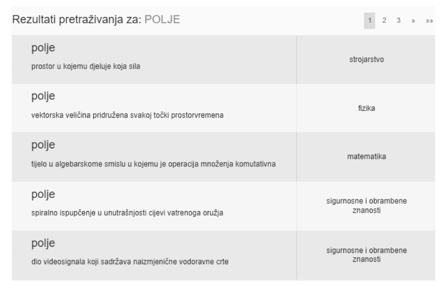
Fig. 3. Example of a multiple entries of the same term in one project – polje (field).

to the need to standardize Croatian linguistic terminology. It lasted from May 2019 to December 2020 as part of HRZZ financing. Following the project's official end date, Jena was implemented as an internal project of the Institute for Croatian Language and Linguistics. The main reason for a follow-up project was the relatively short timeline of the original project and the aspiration of the main editor-in-chief as well as all of the collaborators, to fill in all the gaps in the conceptual system (which solely existed because of a lack of time) and to keep working on linguistic terminology to keep everything up to date. This unique praxis is a good model of sustainability. It would have been ideal if all previous projects processed in STRUNA had implemented something similar to ensure the refinement of already entered terminological units and especially the entry of new ones. As part of the project, 2831 terminological units were processed. A large part of the linguistic terms can be associated with different subfields, and several results of such overlaps are visible both within the project itself and with other projects. In addition, there are terms already entered in STRUNA that have entirely different meanings in linguistics. The following is an example of how the above examples are processed within Jena.