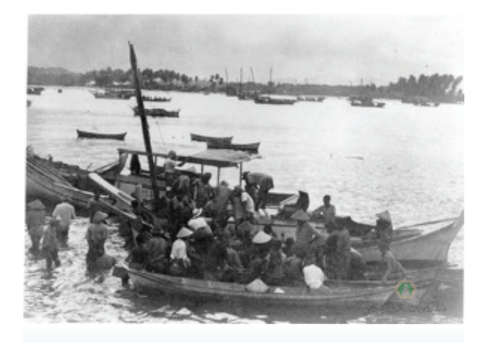
Figure 4. The Atmosphere at Terengganu State Port.

In 1920, the government began to propose the construction of a waqf stop in the town of Chukai Kemaman and Kuala Terengganu to make it easier for Perahu Besar to dock near the Shahbandar Office and the Customs Office. The built endowment can also facilitate any fishing, business and trade activities carried out by the coastal Malay community in the state of Terengganu with foreign countries. The unloading of goods brought from the country of Siam, such as salt and rice, as well as goods brought out, especially fishery products, requires a particular area to develop business and trade activities. In addition, the construction of a stop waqf near the Customs Office can facilitate the affairs of the Head of Customs to collect taxes on export and import goods carried out by local and foreign communities. The Chief of Shahbandar, the Port Officer, can also efficiently control the ships, boats and motor boats that enter the port.