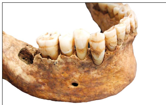
SLIKA 2. Hipoplazija zubne cakline

Većina podataka dobivenih antropološkom analizom nema normalnu distribuciju, pa su za određivanje statističke značajnosti razlika dobivenih rezultata korištene neparametrijske metode. Razlike u prosječnim doživljenim starostima između muškaraca i žena te između uzoraka testirane su pomoću neparametrijskog Mann-Whitneyeva testa. Razlike u učestalosti pokazatelja subadultnog stresa između djece i odraslih te između muškaraca i žena testirane su pomoću hi-kvadrat testa, a u slučajevima kada je to bilo potrebno korištena je Yatesova korekcija. Korelacija između cribrae orbitaliae ,