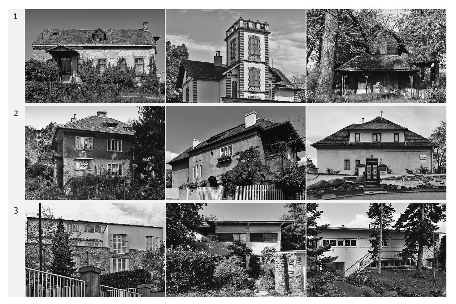
Fig. 1 Comparative display of recent exterior photographs of selected researched buildings FROM DIFFERENT HISTORICAL STYLISTIC PERIODS (FROM LEFT TO RIGHT): 1st Historical-Style Period: Summer residence Tkalčić, Summer residence Veseljak, Summer residence Villa Olga

2<sup>ND</sup> HISTORICAL-STYLE PERIOD: NASTA ROJC SUMMER RESIDENCE, CITY VILLA VRBANIĆ, HOUSE ŠENOA