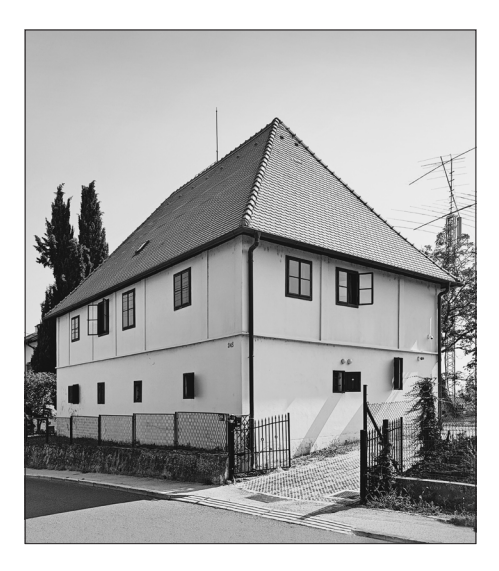
FIG. 5 VILLA ŽIVKOVIĆ-LUBIENSKI, TIME OF CONSTRUCTION 1880-81, AUTHOR KUNO WAIDMANN, ADDRESS JURJEVSKA 27

es from that era are "scattered" on the hilly parts of Zagreb, without the possibility to classify them into clear spatial units. Summer residence Vrhovac (Fig. 4) is one of the six listed historicist summer residences located on Bukovačka Road.