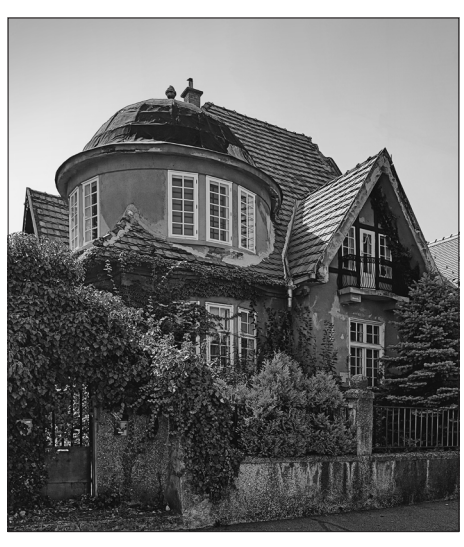
Fig. 6 VILLA REIN, TIME OF CONSTRUCTION 1928-29, AUTHOR RUDOLF LUBYNSKI, ADDRESS KRLEŽIN GVOZD 23 / DUBRAVKIN PUT 1

Fig. 7 Summer residence Wutte, YEAR OF CONSTRUCTION 1923, AUTHOR UNKNOWN, ASSUMPTION: STJEPAN WUTTE, ADDRESS MLINARSKA ROAD 53