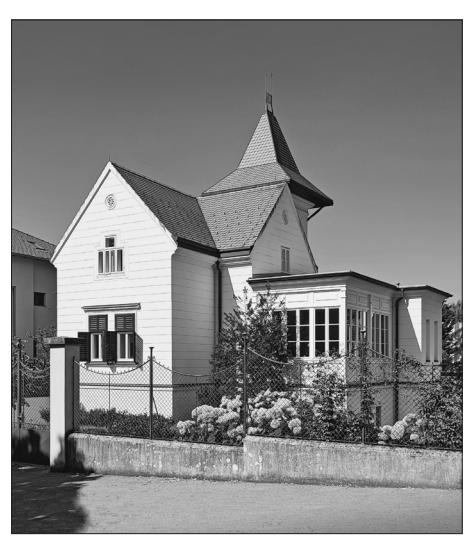
FIG. 3 SUMMER RESIDENCE GRBAC: YEAR OF CONSTRUCTION 1889; ADDITIONS IN 1899; 1906-07; AUTHOR LEO HÖNIGSBERG (AUTHOR OF ADDITIONS GJURO CARNELUTTI), ADDRESS IVANA GORANA KOVACICA 33. AUTHOR OF RENOVATION DESIGN: ALAN BRAUN, M.ARCH, PH.D.

The historical stylistic classification was made on the basis of listing documentation. literature and field tours. For each building, the description given in the listing decision, explaining the characteristics of the buildings for which listing had been decided, was analyzed. By analyzing the time of construction of each building and its main exterior architectural features (size and shape of the building, facade ornamentation, shape of the roof, etc.), as well as by researching biographical data and authorial approaches of individual authors (in the case of known authorship), three main historical-stylistic periods have been identified. The starting year of each of the three historical stylistic periods is determined by the researched building with the earliest year of construction (with the characteristics of that period), while the final year is determined by the latest constructed re-