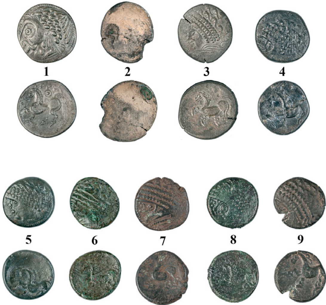
Fig. 1 — Late Iron Age coins from Kuzelin (see: Tab. 1) Sl. 1 — Mlađeželjeznodobne kovanice s Kuzelina (vidjeti: tab. 1)

As already noted, the coin record of the Kuzelin hillfort consist almost exclusively of Tauriscan coins, with only a single exception. It is a tetradrachm of the Zickzackgruppe (Sztálinváros/Dunaújváros) (MPS inv. 166/94; Bilić 2017: 228, 236, 240, Tab. 1: cat. no. 17). This type of coin was issued in the period from the late 3 rd to the 1 st half of the 2 nd century BC in Transdanubia and thus represents an import to south-western Pannonia (Pink 1939: 100; Allen 1987: 29, 80, Map 3; Dembski 1998: 46, 112; Torbágy 2000: 30; Ziegauš 2010: 215). Moreover, its Lt C2-date apparently suggests a different temporal horizon in comparison to the rest of the Kuzelin assemblage, both archaeological in general and numismatic in particular. In one way or another, it testifies to the connections – either direct or by way of intermediaries – of the inhabitants of the hillfort with a region dis-