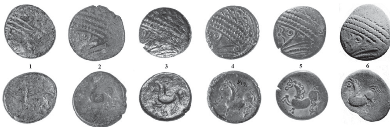
Fig. 3 — Coins of the Kuzelin A type: 1–2 Kuzelin (1 MPS 4184, photo by: I. Krajcar; 2 MPS 8338, photo by: I. Krajcar; with permission of the MPS); 3 Zagreb Upper Town (MGZ 499 A, photo by: M. Gregl; with permission of the MGZ); 4 AMZ A919 (photo by: I. Krajcar); 5 Obljaj (private collection, photo by: V. Kramberger; Cesarik, Kramberger 2018: 139, no. 44); 6 Gradina at Bruvno (private collection, photo by: M. Ilkić, reproduced with permission)

kao „izvorni“ tauriščanski novac (potvrđen u velikim ostavama, a sadržavao je veći udio srebra). Kako je metalurška analiza izvršena na samo jednoj kovanici ovog tipa (AMZ A919: Cu 72 %, Ag 5,5 %, Sn 5,5 %), bilo bi brzopleto izvlačiti generalizirane zaključke iz očito nedostatnih podataka, ali provizorno se može tvrditi da su sve poznate kovanice ovog tipa bile načinjene od slitine bakra s manjim udjelom srebra. Bez obzira na to, ova pojava mora se razumjeti kao neprekinuti nastavak ranije tradicije proizvodnje kovanica u regiji, potvrđene u razdobljima Lt C2 i/ili Lt C2/D1.