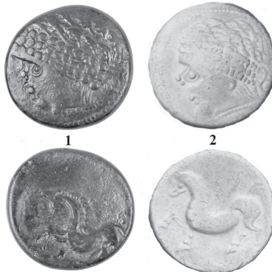
Fig. 6 — Coins from Kuzelin (1 MPS 7374, photo by: I. Krajcar) and Osječenica (2, courtesy of A. Durman) Sl. 6 — Kovanice s Kuzelina (1 MPS 7374, snimio: I. Krajcar) i Osječenici (2, ljubaznošću A. Durmana)

i avers i revers ove kovanice pokazuju sličnost sa samoborskim Prijelaznim tipom, ali ipak ona ne dijeli pečate s kovanicama ovog tipa iz ostave Samobor–Okić. Kovanicu s Osječenice – zajedno s još jednom, pobliže nedefiniranom, taurišćanskom tetradrahmom (Bilić 2017: 243, tab. 1: br. 53) 26 – pronašao je lokalni zaljubljenik u arheologiju (Ožanić 1998: 36). Čini se da su te dvije kovanice jedini opipljivi dokaz za pretpostavljeno postojanje mlađeželjeznodobnog naselja na gradini jer drugi materijal iz tog razdoblja nije dokumentiran u studijama koje raspravljaju o lokalitetu, nasuprot nalazima iz kasnog brončanog i ranog željeznog doba te rimskog razdoblja (Durman 1992: 126–127; Ožanić 1998: 27–29). Iako je to možda donekle nesigurno, ipak se ne čini previše odvažnim pretpostaviti postojanje mlađeželjeznodobnog naselja na lokalitetu koji je