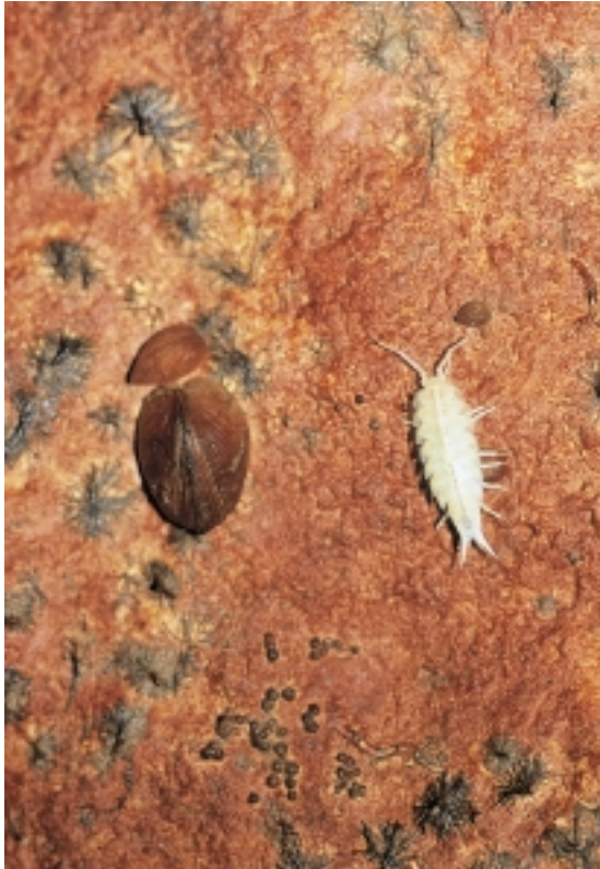
Fig. 3. Photo of specimens of genus Congeria attached to the wall of the first siphon in Markov Ponor, along with the amphibious isopod crustacean Tithanetes dahli .

Clearly, what was involved here was a group of juvenile bivalves. Later, there was an investigation of new holes and siphons from the entrance part to the recent last point of the 1725 m long system in which thousands of live and bigger Congeria were found. Their shells have dimensions of up to 18 mm, smaller than those of the biggest specimens from populations in Hercegovina and Dalmatia (9–24 mm; MORTON et al. , 1989). In some places a drift of shells up to 50 cm thick was found (Fig. 4). These finds show that Congeria must have inhabited the underground spaces of Markov Ponor for a long time.