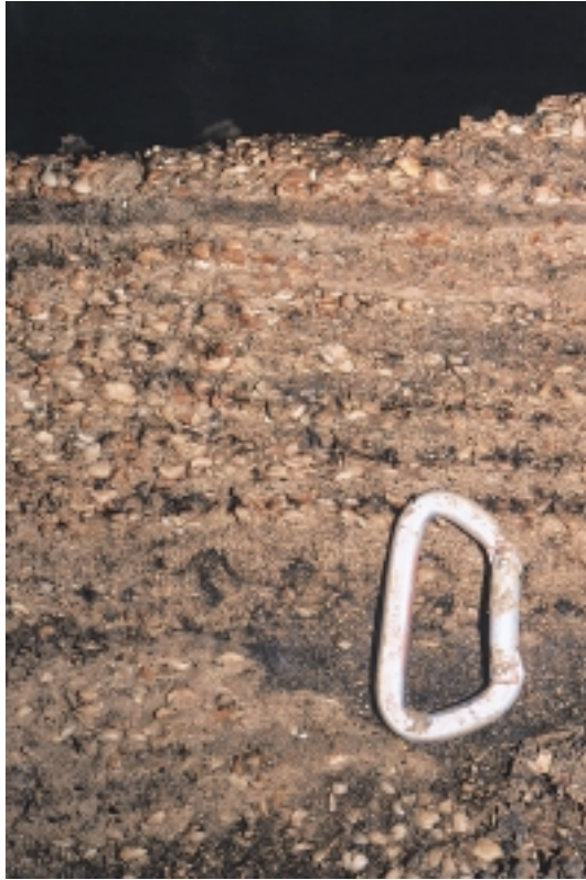
Fig. 4. Photo of a detail of the up to 50 cm deep sediment (drift) from one of the channels of Markov Ponor: visible are shells of the bivalve Congeria in almost all layers.

about the degree of similarity of the populations of the distant parts of the range of the species Congeria kusceri . We know that as recently as the Miocene there was a whole series of Congeria species in the Dinaric area (KOCHANŠKY-DEVIDE & SLIŠKOVIĆ, 1980), and some of them could theoretically have survived changes in habitats only in today's subterranean refuges. At the same time this might be the last Pliocene species, which was perhaps more widely distributed, today some of the populations of it being found in hydrologically detached underground systems.