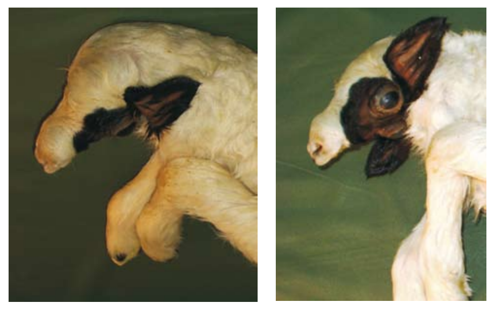
Fig. 1. Dorsolateral (left) and ventrolateral (right) aspect of the head of the agnathic lamb

with increased in size (macrophthalmia), protruding eyeballs (exophthalmia) could be observed. The occipital condyles were present but it was impossible to distinguish and identify the bones of the skull. No apparent foramens except the foramen magnum could be observed. The hyoid apparatus was absent. On the lateral parts of the skull a branching vessel resembled the facial artery. The salivary glands were absent. The cranial cavity was almost empty, except a small amorphous encephalic substance which appeared to be undifferentiated. Dissection of the body revealed the absence of the right kidney and ureter.