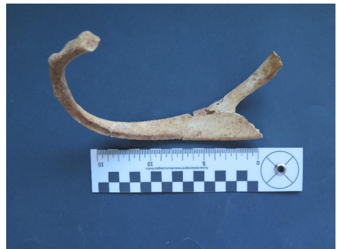
Figure 5: Bifid rib in the male from Grave 15.

One individual (Grave 15) had multiple anomalies of the sternum in the form of sternal foramina and fused elements of the sternum (Fig. 6). This individual also has the bifid rib mentioned earlier. The first sternal foramen is located between the fourth and fifth segment of the body of the sternum, while the second foramen being at the tip of the xiphoid process. Besides the foramens,