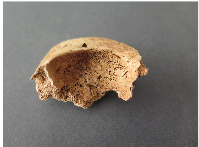
Figure 3: Active cribra orbitalia in the right orbit of the subadult from Grave 7.

Periostitis occurs in six out of 24 subadults (25%) and does not occur in adults, thus representing 12.5% (6/48) of the total Pula sample. In all cases, periostitis was in