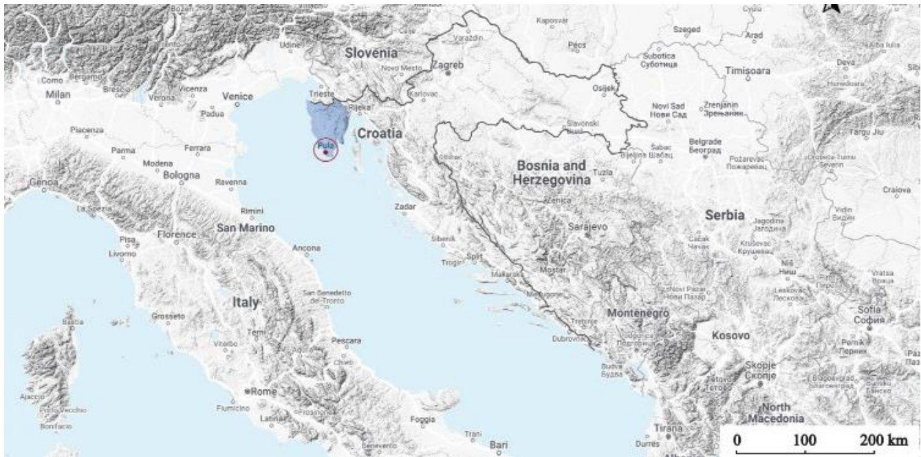
Figure 1: The location of Istria County (blue) in Croatia and Pula (circled in red). The map was generated using the online web tool Snazzy maps (Krogh, 2019) and edited in Krita software (version 5.0.6).

create a picture of individual, but also communal health (Manifold, 2014).