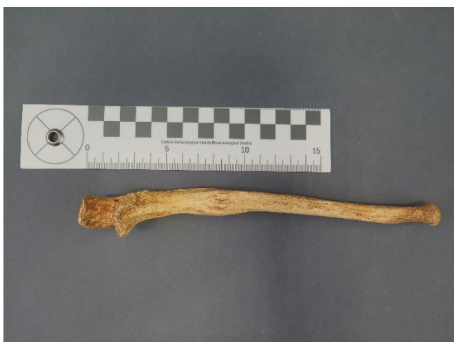
Figure 4: Well healed fracture of the left ulna in the female from Grave 24.

Two individuals in the Pula skeletal sample had bifid ribs. In both cases, the rib anomaly is unilateral and on the left side of the individual's body. In the case of the male from Grave 4, the bifid rib is the sixth left rib with the thickening and bifurcation of the sternal end of the rib. The sternal end is completely split into the inferior and superior arm of the rib. One male individual (Grave 15) had the bifurcation of the fourth left rib (Fig. 5). The rib is also completely split at the sternal end into an inferior and superior arm.