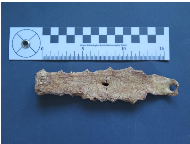
Figure 6: Sternum of the male from Grave 15 with multiple sternal foramina and the xiphoid process fused with the body of the sternum.

the xiphoid process is fused with the body of the sternum.