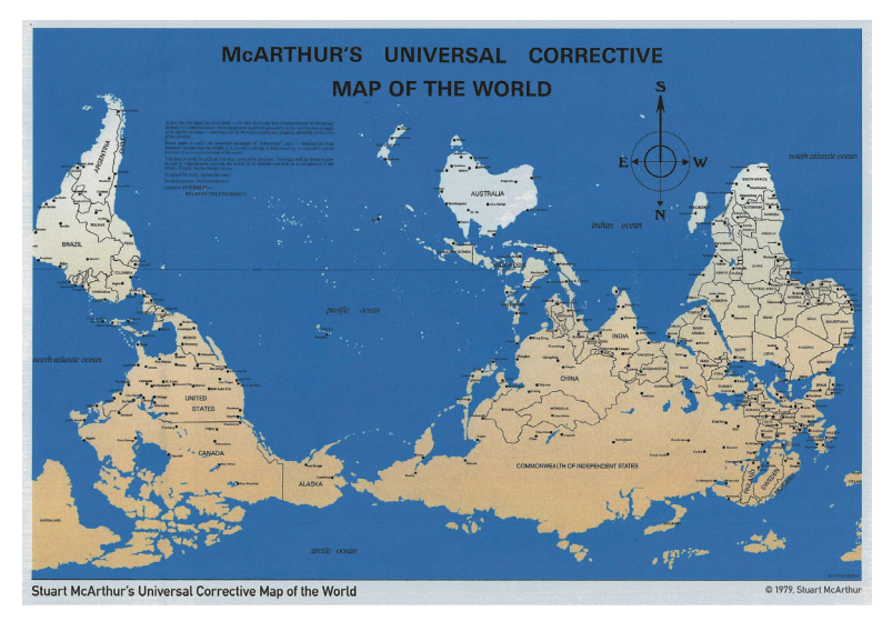
Fig. 2. McArthur's universal corrective map of the world, Stuart McArthur, 1979

Fig. 1. Gall-Peters projection of the world map