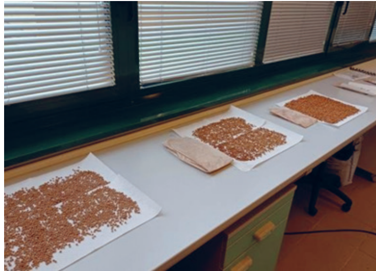
Figure 2: The process of reducing moisture content (8-14%) of hawthorn seeds at room temperature Slika 2: Proces smanjenja sadržaja vlage (8-14 %) u sjemenu glogova pri sobnoj temperaturi

at room temperature to reduce their moisture content to 8-14%, which took several days (Figure 2, 3).