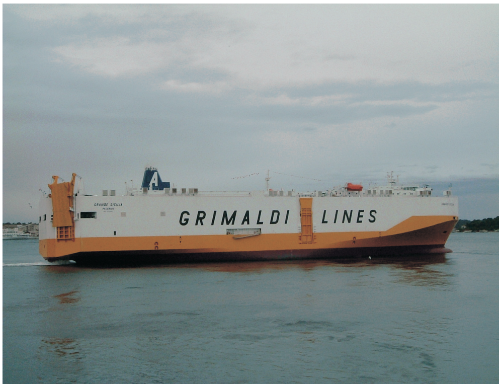
Car carrier Grande Sicilia

Car carrier (4350 cars) Length, overall 176.70 m Breadth, moulded 31.10 m Draught, scantling 8.75 m Deadweight at scantling draught 12 500 t Depth, moulded 28.00 m Speed, trial 20.3 knots Main engine: Uljanik/ MAN – B&W 7 S 50 MC – C Output: 11 060 kW / 127 r.p.m.