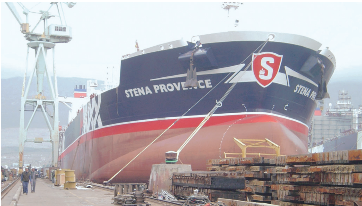
Stena Provance u vezu