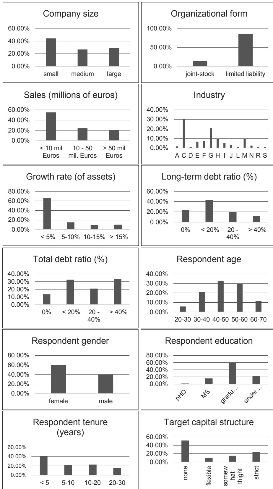
Figure 1. Characteristics of companies (and respondents) in sample