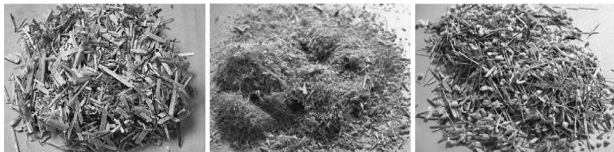
Figure 2 Hemp shives (left), kenaf shives (center) and topinambur (right)

Slika 1. Opća korelacija između gustoće sirovine i savojne čvrstoće ploča iverica