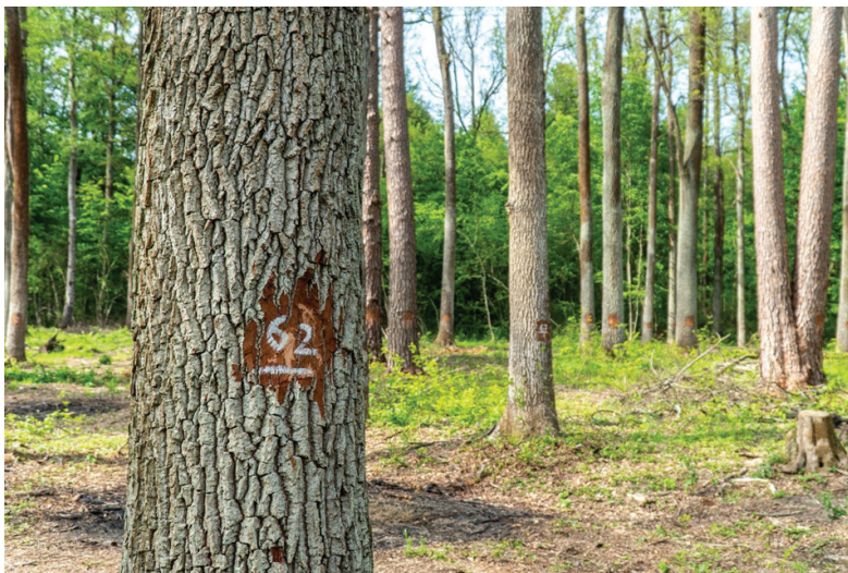
Figure 4. Pedunculate oak stand after the first intervention in shelterwood cutting.

Natural regeneration after cutting at the beginning of the vegetation period 2020 consisted of 8,658 individuals·ha -1 , mostly seedlings with the height of up to 50 cm. Among different tree species, beech dominated with 3,426 ind.·ha -1 , and sycamore with 2,130 ·ha -1 . After three vegetation periods in October 2022, the number of ingrowth increased to 21,847 ind.·ha -1 with 7,663 beeches·ha -1 . Moreover, an admixture of pedunculate oak (543 trees·ha) and Scots pine (924 trees·ha -1 ) could be found.