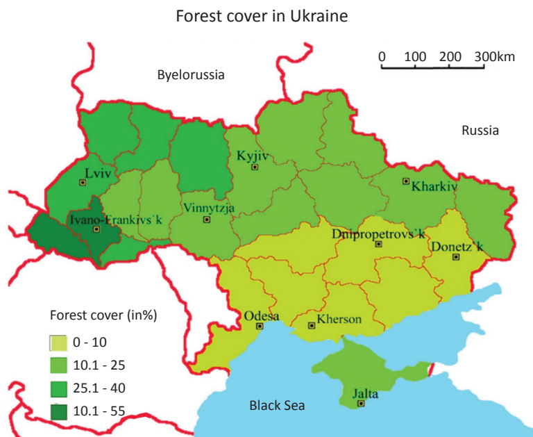
Figure 1. Map of Ukraine with forest cover (see Lavnyy and Spathelf 2018).

The legal basis for managing Ukrainian forests is the Forest Code of Ukraine. This national law regulates the most critical issues of forest ownership, forest management, and