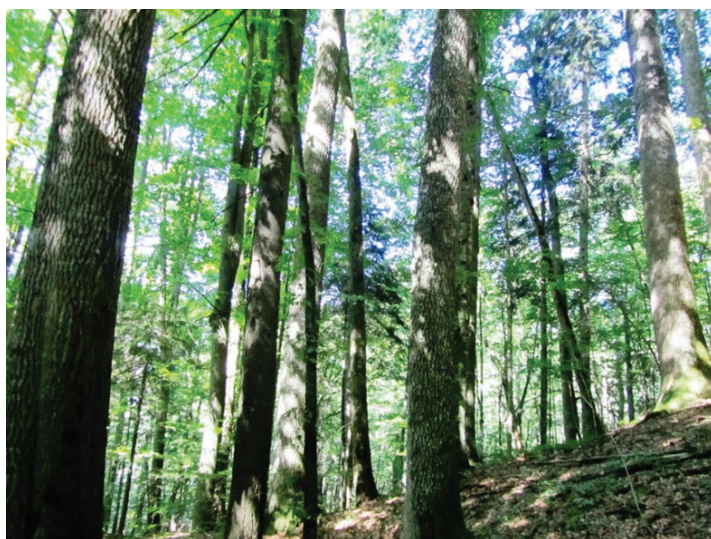
Figure 3. Primeval forest Kuzii, with common ash, Norway maple, silver fir, European beech and Norway spruce.