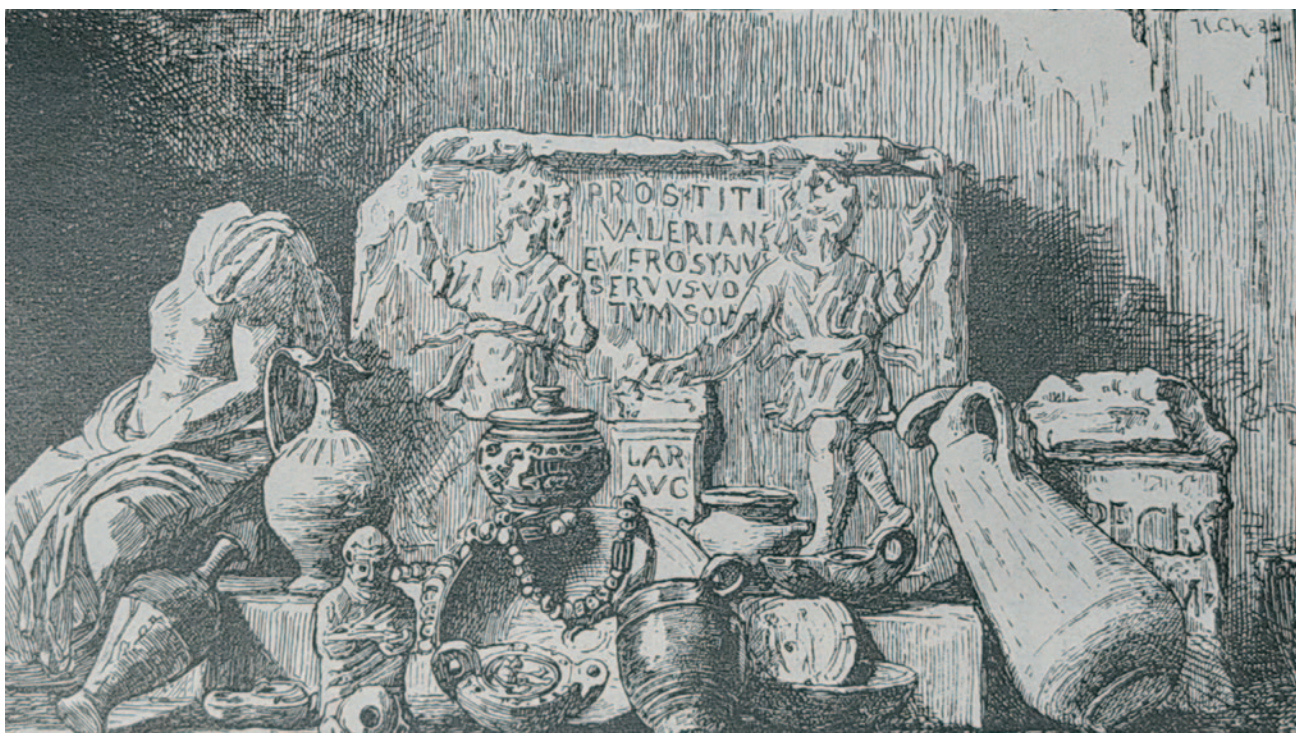
Sl. 4 — Crtež reljefa s prikazom Lara, Salona (Jelić, Bulić, Rutar 1894: T. XV) Fig. 4 — Relief drawing depicting the Lares, Salona (Julić, Bulić, Rutar 1894: Pl. XV)