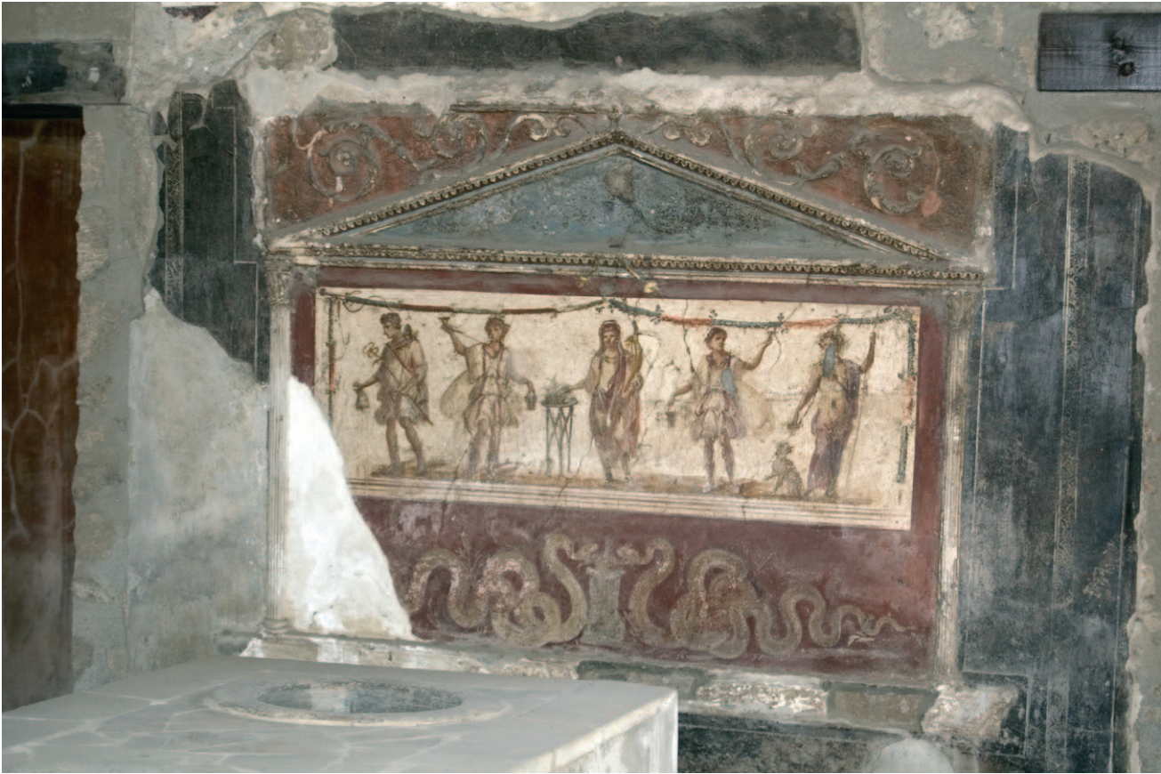
Sl. 1 — Lararij uz kućno ognjište ( casa di Vetutius Placidus ), Pompeji Fig. 1 — Lararium next to the home hearth ( casa di Vetutius Placidus ), Pompeii

mladića odjevenih u tuniku veselog izraza lica, s rogom obilja ( cornucopia ) ili paterom. Čuvali su ih u posebno izrađenim ukrasnim ormarićima, nišama, ili malim kućnim svetištima ( aedicula ) 7 , koji su se nazivali larariji ( lararium ), 8 a bili su smješteni u blizini kućnog ognjišta ili ulaza u dom. Njihov prikaz mogao je biti naslikan i na zidu pored ognjišta, unutar malih svetišta (sl. 1).