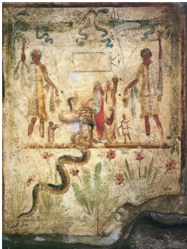
Sl. 7 — Lararij s prikazom žrtvovanja Juno i Genija Larima, kuća Julija Polibija, Pompeji (© Ranieri Panetta 2005: 108) Fig. 7 — Lararium with a depiction of the sacrifice of Juno and Genius to the Lares, House of Iulius Polybius, Pompeii (© Ranieri Panetta 2005: 108)

koji pokazuje da je posveta podignuta Augustovim Larima ili Laribus Augustis da je posveta podignuta Uzvišenim Larima. U prva dva slučaja riječ je o Augustovim vlastitim božanstvima. Već smo prethodno spomenuli da je 7. g. pr. Kr. August preustrojio administrativni sustav grada Rima čime je glavni grad podijelio na 14 okruga i 265 gradskih četvrti ( vici ). Svaka je gradska četvrt štovala unutar svojeg svetišta ( compita ) kult Lara raskrižja ( Lares Compitales ), te je ovom prilikom car August zamijenio spomenute javne Lare svojim obiteljskim i dodjelio im epitet Augusti , koji se od tada nazivaju Lares Augusti . Time se Augustovim Larima prinose žrtve i molbe za samog cara. Georg Wissowa smatra da je ovaj epitet pokazivao da su se oni štovali na isti način na koji ga je car štovao u svojem obiteljskom kultu (Wissowa 1912: 166–175). Međutim, Duncan Fishwick to osporava i kaže da je ipak prevelik broj božanstva nosio taj epitet, od kojih su mnogi bili lokalnog provincijskog karaktera i teško da su svi oni mogli imati posebno mjesto u carskoj kući