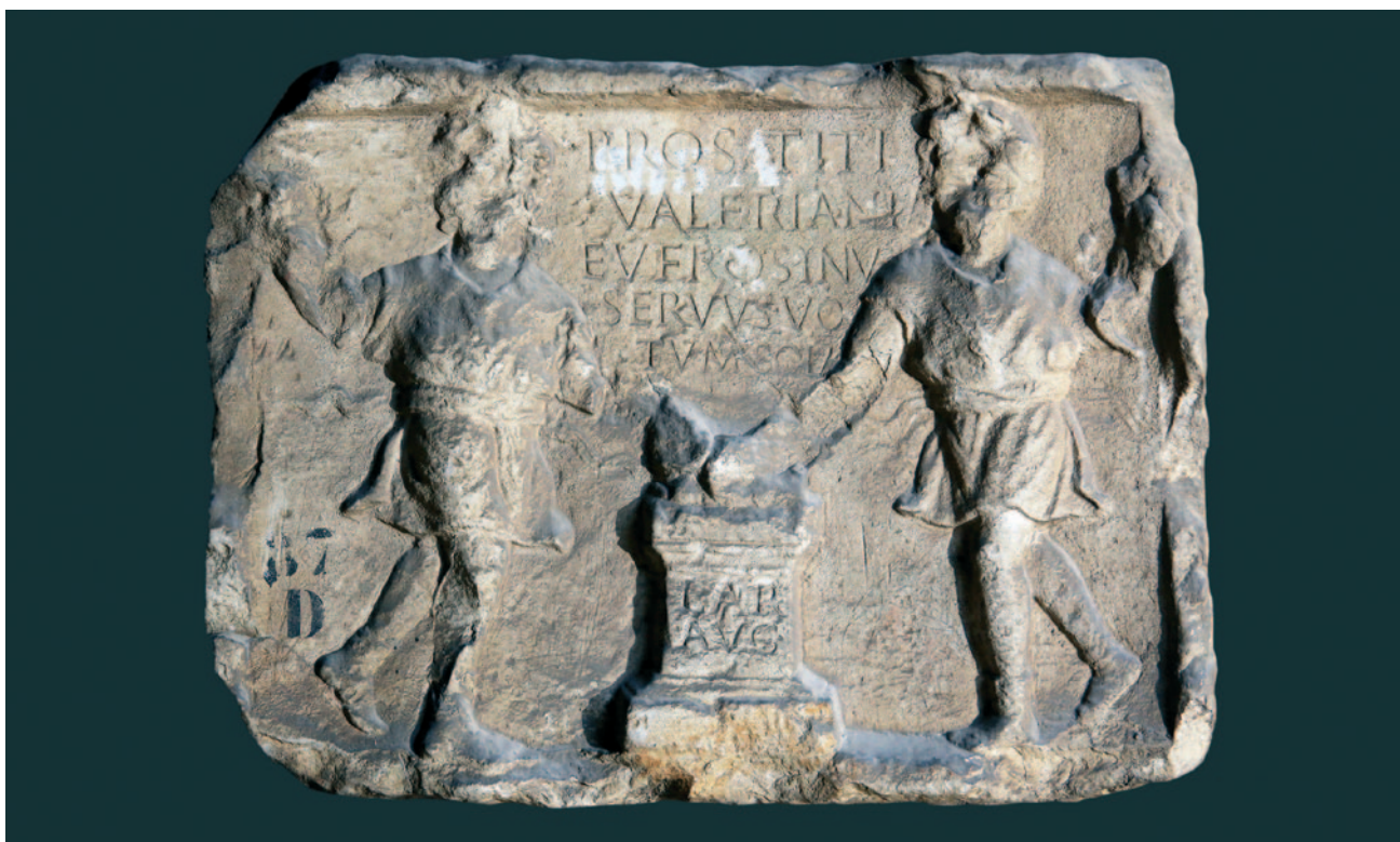
Sl. 5 — Reljef s prikazom Lara, Salona, Arheološki muzej Split, inv. br. A 865, D87, uz dozvolu Fig. 5 — Relief depicting the Lares, Salona, Archaeological Museum Split, inv. no. A 865, D87, with permission