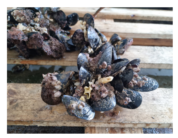
Fig. 3. Photo of live specimens of Paraleucilla magna found as biofouling on Mytilus galloprovincialis .

for the first time in these aquaculture settings in the bays of Amsa and M'diq. Our monitoring at both sites confirms the presence of P. magna individuals colonizing the infrastructure and surrounding substrates of local aquaculture facilities.