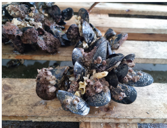
Fig. 3. Photo of live specimens of Paraleucilla magna found as biofouling on Mytilus galloprovincialis .

for the first time in these aquaculture settings in the bays of Amsa and M'diq. Our monitoring at both sites confirms the presence of P. magna individuals colonizing the infrastructure and surrounding substrates of local aquaculture facilities.