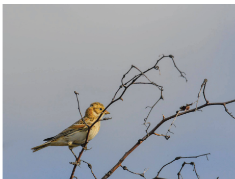
Figure 9. Lapland Longspur - Calcarius lapponicus laponska strnadica