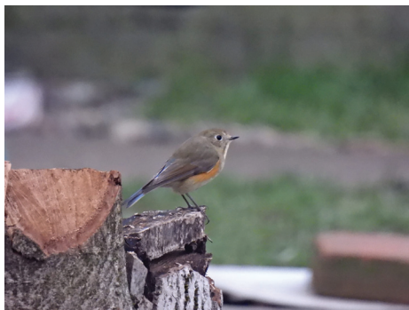
Figure 7. Orange-flanked Bush-robin - Tarsiger cyanurus - modrorepka