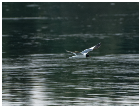
Figure 2. Sabine's Gull - Xema sabini - galeb lastar