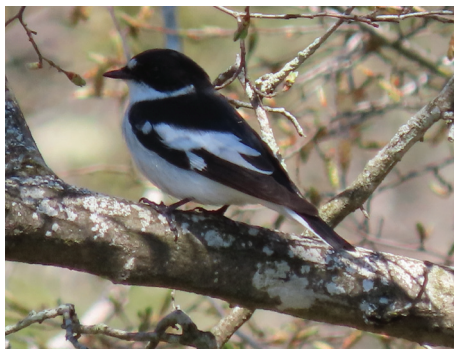
Figure 8. Semi-collared Flycatcher - Ficedula semitorquata - sirijska muharica