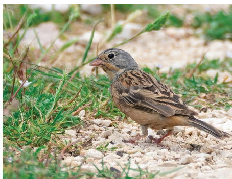
Figure 10. Cretschmar's Bunting - Emberiza caesia - rusobrada strnadica