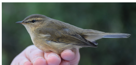
Figure 6. Dusky Warbler - Phylloscopus fuscatus - tamni zviždak