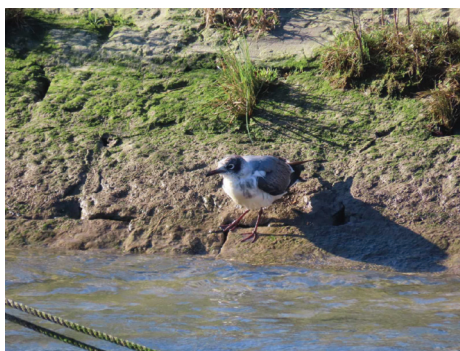
Figure 3. Franklin's Gull - Larus pipixcan - priijski galeb