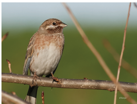
Figure 11. Pine Bunting - Emberiza leucocephalos - bjeloglava strnadica (photo: S. Jelić Županić)