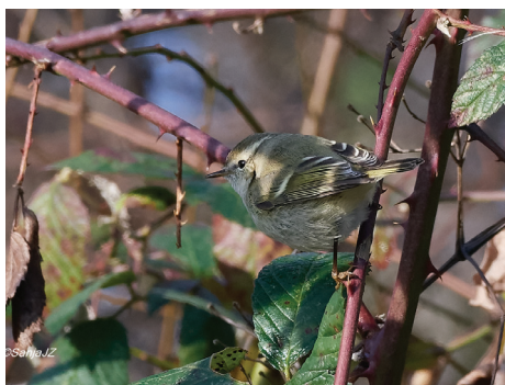
Figure 5. Hume's Leaf Warbler - Phylloscopus humei - srebrnastoprsi zviždak