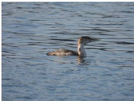
Figure 1. Yellow-billed Loon - Gavia adamsii - žutokljuni plijenor