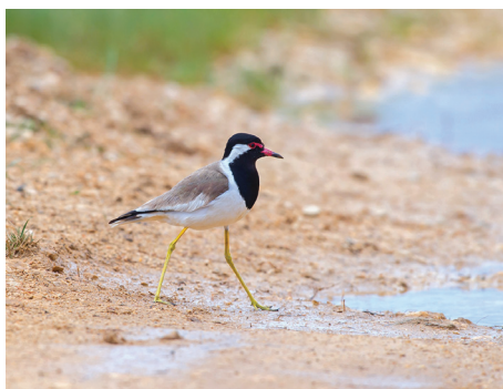
Figure 12. Red-wattled Lapwing - Vanellus indicus - vivak naočar