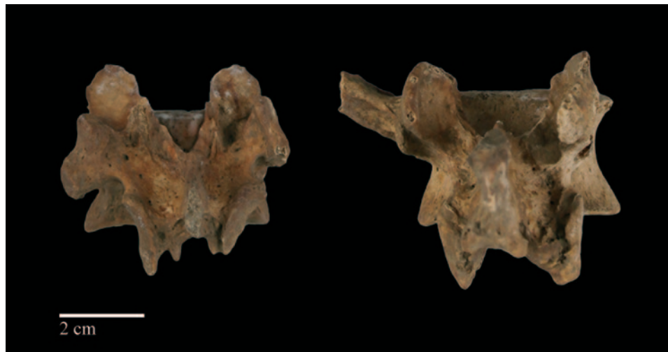
Sl. 3 – Asimetrija zglobnih ploha na prsnom i slabinskom kralješku (snimila i prilagodila: T. Kokotović, 2024) Fig. 3 – Asymmetric lumbal facets on thoracic and lumbar vertebrae ((photo and adapted by: T. Kokotović, 2024)

sakralnog kralješka, a s lijeve strane poprečni nastavak prvog sakralnog kralješka nije spojen s ostatkom križne kosti.