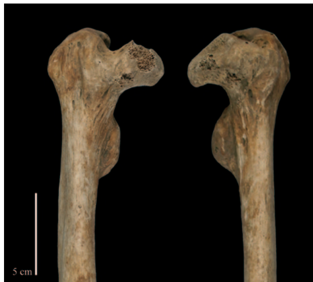
Sl. 7 – Glave desne i lijeve bedrene kosti kostura iz groba 16 Fig. 7 – Left and right femoral heads of the skeleton from grave 16

Legg-Calvé-Perthesova bolest definira se kao osteohondroza glave bedrene kosti, a rezultat je opstrukcije krvotoka u predjelu glave