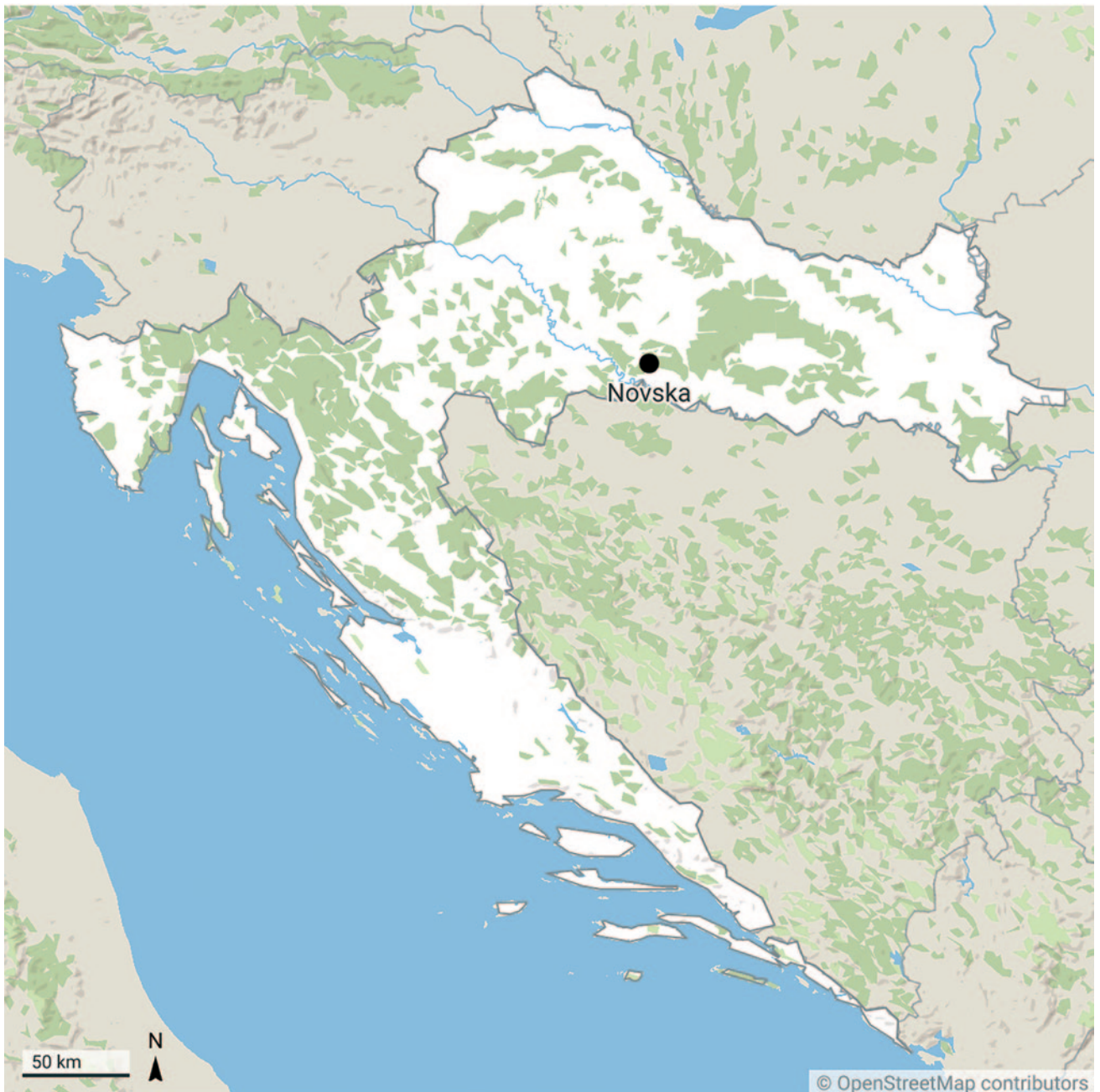
Karta 1 – Položaj crkve sv. Luke Evanđeliste u Novskoj Map 1 – Position of the Church of St. Luke the Evangelist in Novska

rakteristika, Belaj i Stingl (2019: 95) pretpostavljaju kako je riječ o privatnoj, dvoranskoj crkvi ili kapeli nekog novljanskog gospodara. U istraživanjima su ukupno istražena 94 groba, od kojih je 50 grobova pronađeno unutar crkve, a njih 44 izvan. Identificirana su sveukupno dva horizonta pokopavanja: stariji, kasnosrednjovjekovni horizont, iz vremena 1. graditeljske faze koji traje do dolaska Osmanlija polovicom 16. stoljeća, kada i sama najstarija cr-