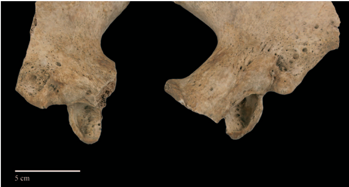
Sl. 5 – Lažni acetabuli na kosturu iz groba 16

Fig. 4 – Left and right acetabula on the skeleton from grave 16