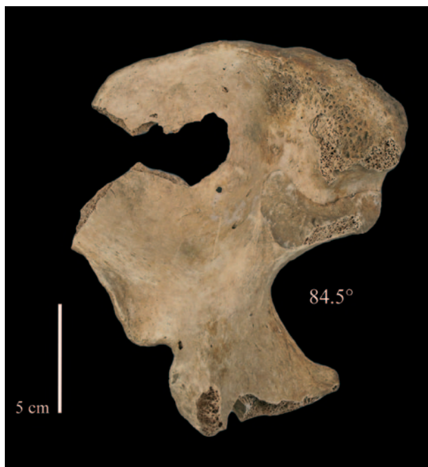
Sl. 6 – Kut velikog sjednog ureza na desnoj zdjelici (snimila i prilagodila: T. Kokotović, 2024) Fig. 6 – Great sciatic notch angle on the right pelvic bone (photo and adapted by: T. Kokotović, 2024)

postmortalnog oštećenja kosti, na lijevoj strani kut velikog sjednog ureza nije bilo moguće izračunati. Glave obje bedrene kosti manjeg su opsega i volumena nego u normalnim slučajevima (sl. 7). Glava desne bedrene kosti je djelomično sačuvana, a glava lijeve bedrene kosti (koja je kompletno sačuvana) ovalnog je oblika, dimenzija 30 x 45 mm te je na njoj uočen porozitet. Vrat obje bedrene kosti je blago skraćen i zadebljan. Mali obrtač na obje bedrene kosti izduženog je oblika. Povećana anteverzija vrata uočena je na lijevoj bedrenoj kosti. Kut anteverzije na desnoj bedrenoj kosti iznosi 11,3°, a na lijevoj 38,6°.