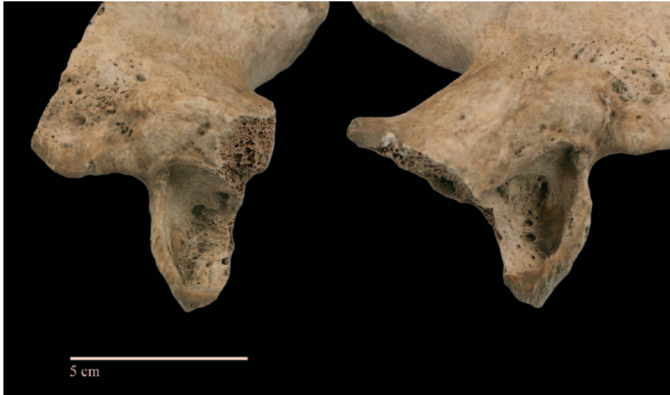
Sl. 4 – Lijevi i desni acetabuli kostura iz groba 16

Fig. 4 – Left and right acetabula on the skeleton from grave 16